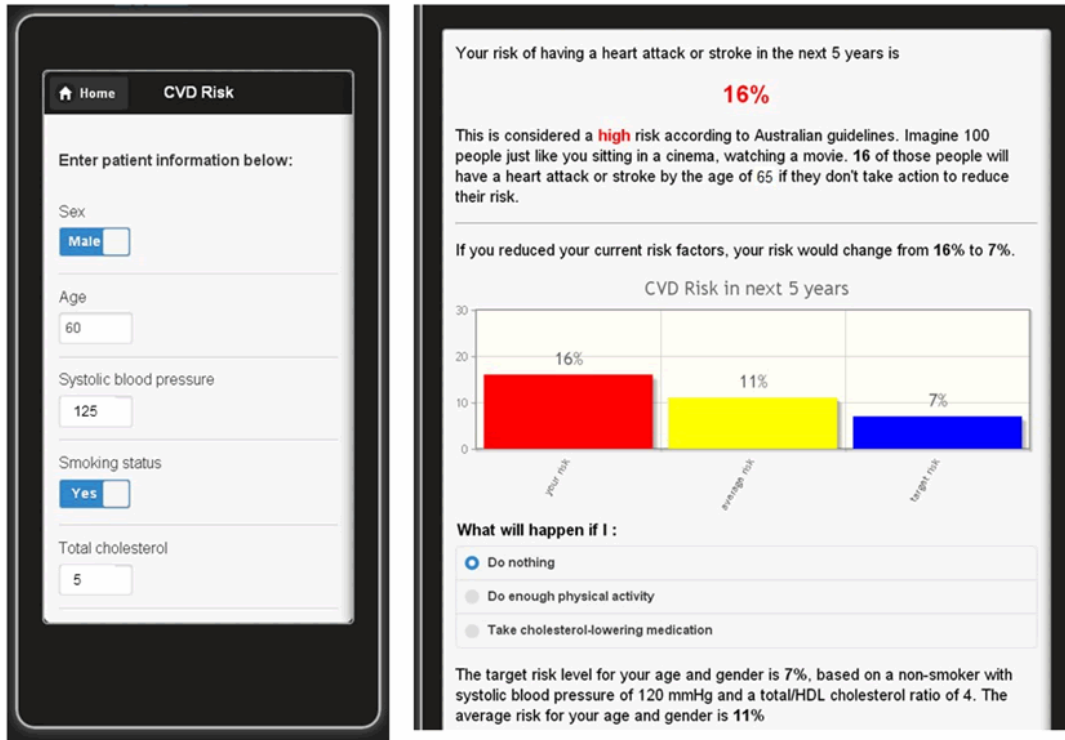
Figure 1: Healthy.me App risk calculator (risk factor questions & risk result)