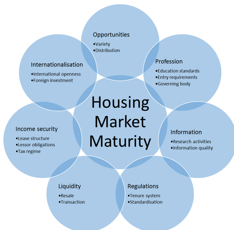
Figure 1: Conceptual Framework of Housing Market Maturity (Khanjanasthiti et al. , 2017)

Figure 1 synthesises the findings from the literature review above into a holistic, original housing market maturity framework.