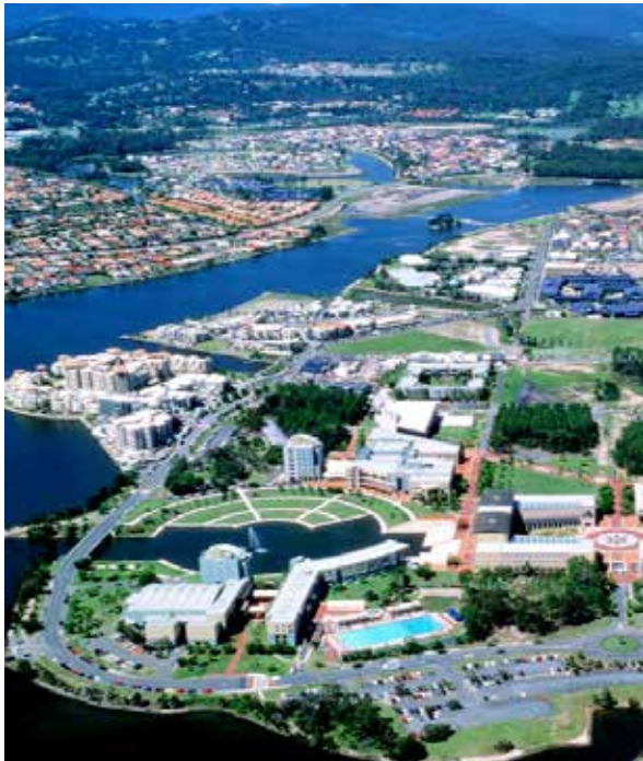
FIGURE 1 Bond University and Varsity Lakes