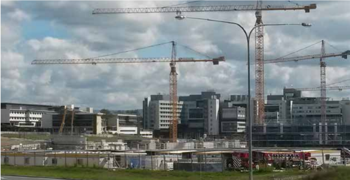
FIGURE 3 Gold Coast Health and Knowledge Precinct (GCHKP) under construction adjacent to Gold Coast University Hospital in 2016. The precinct will initially be used as the Commonwealth Games Village when the Gold Coast hosts the Games in 2018.