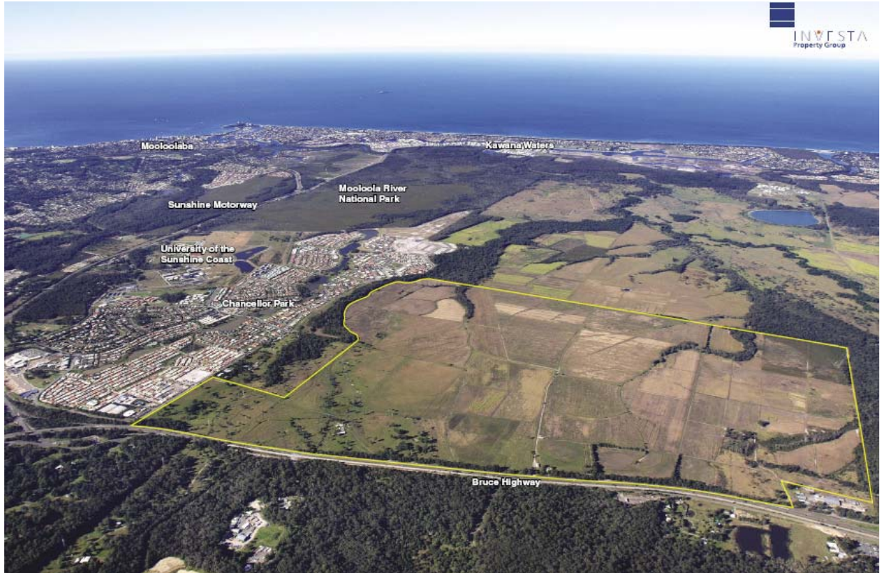
Figure 1: Aerial view of Sippy Downs, with the Investa Palmview land outlined