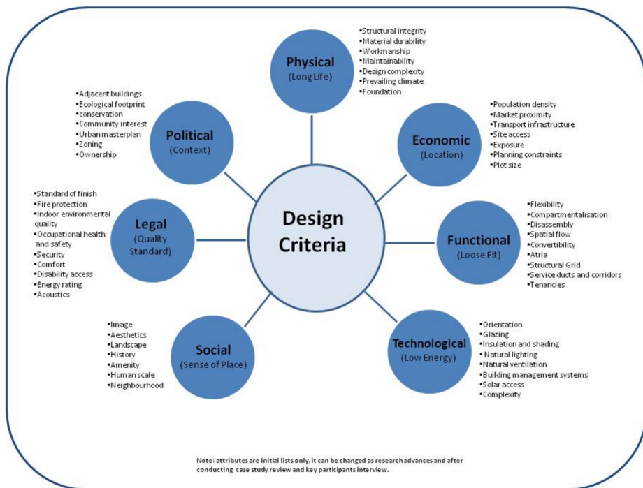
Fig. 5: Proposed adaptSTAR Model

As the research progresses, this initial list will be evaluated to determine the weighted value of its associated and corresponding design elements (Stage 2). The set of design criteria reflect the obsolescence categories: Physical (Long Life); Economic (Location); Functional (Loose Fit); Technological (Low Energy); Social (Sense of Place); Legal (Quality Standard) and Political (Context). An example of this framework is shown in Figure 5.