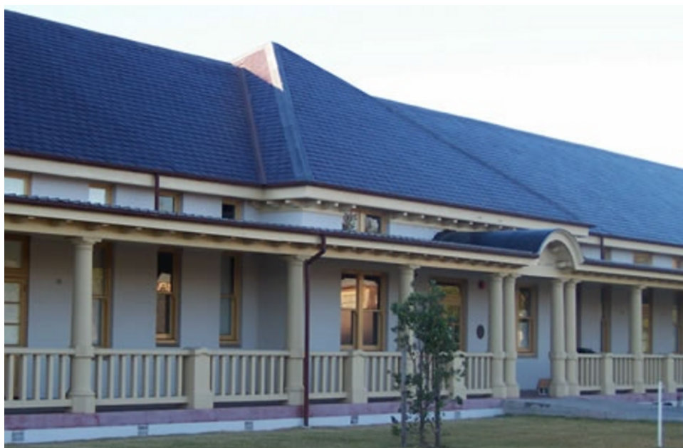
Fig. 4: Adaptively-reused Prince Henry Hospital

From the case studies, some of the possible design criteria have been identified. A preliminary unweighted list of design criteria was prepared based on interviews with the architectural team and a survey of relevant documentation. In identifying the list of factors, a semi-structured interview questionnaire with the following themes was prepared: