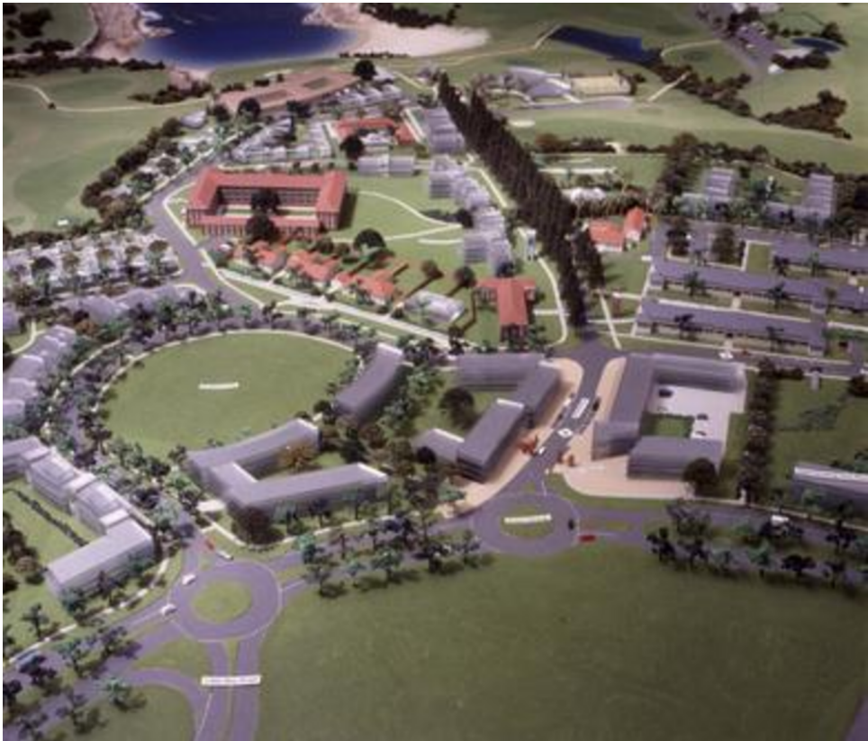
Fig. 3: Prince Henry Master Planned Development

velopments while keeping 80% of the site in public ownership. Over 90% of demolition materials were reused and buildings comply with energy efficiency principles while the whole redevelopment is based primarily on environmentally sustainable design principles. The Prince Henry master plan starts with the premise of conservation and enhancement. Its principles derive from analysis and evaluation of the physical and cultural framework of the site and surrounding environment. They address ecological sustainability, urban design, heritage, amenity and accessibility. Noteworthy also to mention is that the Prince Henry redevelopment won the President's Award from the Urban Development Institute of Australia in 2009, which was the highest accolade within the UDIA awards program both state-wide and nationally.