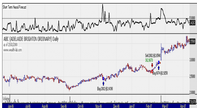
Figure 3 GMMA signals filtered with ANN

Of course the result will not always be that all whipsaws are removed. Rather, only whipsaws which are predictable using the ANN inputs will be removed.