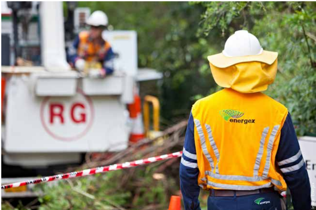
Energex representatives participate in local, district and state emergency management groups in Queensland.

on the development of strategic or responsive public-private partnerships involving small to medium private sector organisations, or even large, 'less-critical' private enterprises (e.g. the mining industry). The emphasis is on broad procurement protocols (e.g. for evacuation centre and emergency supplies), general community-building and individual business continuity.