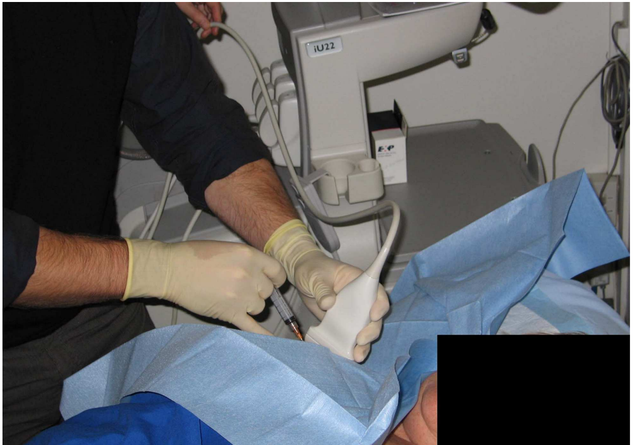
Fig 2. Ultrasound guided diagnostic injection into the subacromial bursa