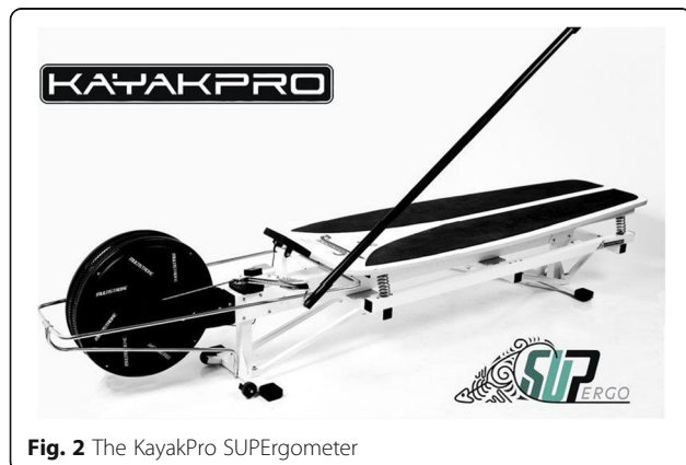
Fig. 2 The KayakPro SUPergometer

All statistical analyses were completed using the IBM Statistical Package for the Social Sciences (SPSS, Version 20.0) software program (mean \pm SD) comparing initial test, pre and post testing for the groups. Normality was assessed via Shapiro-Wilk ( P < 0.05 ) and visual inspection of the data's histogram and tests of sphericity were also performed to ensure minimising type 1 errors. Peak Speed, stroke rate, anaerobic peak speed and anaerobic distance covered were deemed to not be a normally distributed, therefore a Friedman Test was utilised with a post hoc Wilcoxon Signed Ranks test was utilised. All other data was deemed to be normally distributed and therefore a repeated measure ANOVA was utilised with a Bonferonni adjustment for multiple comparisons