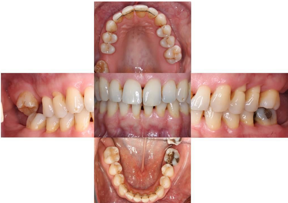
Fig. 1 Clinical photographs

A 59-year-old female patient who had recently moved from abroad presented at her dentist seeking periodontal care. She had received periodontal treatment and maintenance at a university dental clinic for the previous 8 years. She was a former smoker, who had smoked approximately 20-30 cigarettes per day before successfully quitting 12 years previously. There were no other documented periodontal risk factors and she was medically fit and well. Clinical examination revealed clear and obvious interproximal recession/clinical attachment loss (Fig. 1). Given the history of periodontitis reported by the patient and the evidence of interproximal clinical attachment loss due to periodontitis, a BPE was not appropriate and a full periodontal assessment, including a detailed pocket chart (DPC) was indicated (Fig 2).