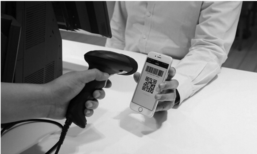
Figure 2: A shopper uses Alipay's QR Code to pay for his purchase

send virtual red envelopes, a built-in function of Alipay or WeChat Pay apps, rather than traditional red paper envelopes. 46 Around the world, mobile payment takes place in a variety of forms, including near-field communication (NFC or contactless), QR codes and cloud-based pay, depending on different technologies adopted. In Europe, mobile payment services usually embrace the NFC technology, which means shoppers swiping their smartphones over a chip reader. 47 In contrast, most mobile payment transactions in China have been conducted through QR codes generated by mobile payment apps. Consumers use their Alipay app to generate a one-off QR code and then retailers will hold a special reading gun to scan the QR code and complete the transaction (see fig.2 below). Alternatively, some retailers print out their Alipay's accounts (presented as QR codes) near the counter for shoppers to use their smartphone cameras to scan and make payment.