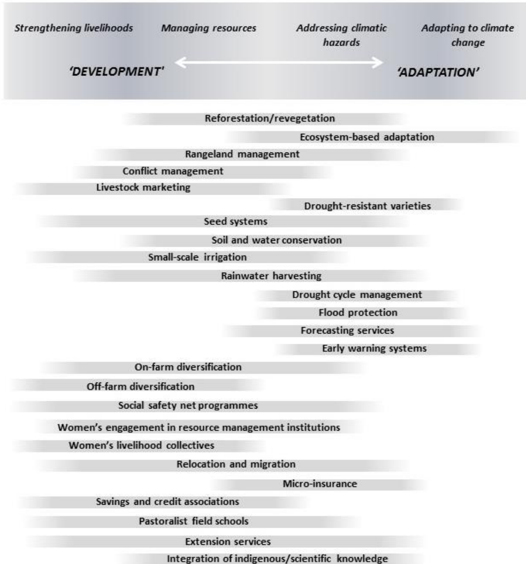
Figure 2: Locating responses on a development-adaptation spectrum

case, there is some funneling implied, from activities of more generalised benefit for livelihood/wellbeing toward activities that more specifically tackle climatic risks. Nevertheless, it should be reiterated that, whether general or specific in this sense, all are viewed within the literature as potential means to strengthen resilience to climate-related social-ecological risks.