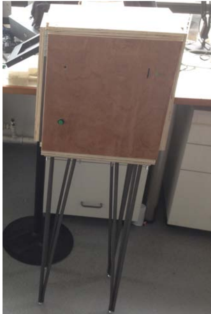
Figure 5: Demonstrating a realised idea from a workshop—a prototype vending machine that dispenses a smell of ramen. ( https://vimeo.com/308564887 )

object, when it is dropped—a participant combined the weight card and sound card in the second task; a robot that experiences pain instead of the patients—a participant combined the pain card and motion card in the first task; a machine that dispenses a smell of ramen (Japanese noodle) (Fig. 5), which is designed to recall a friend’s delightful memory in Japan—a participant combined the touch card and odour card in the second task.