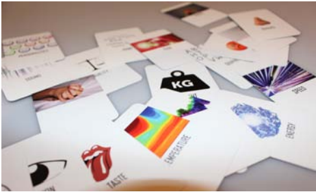
Figure 3: Synaesthetic-translation tool: initially developed 18 different cards—touch, vision, sound, speed, motion, weight, temperature, time units, colour, personalities, odours, taste, energy, graphemes, shape, anger, pain, and name.