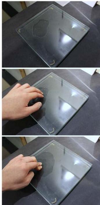
Figure 2: Demonstrating the translative property of synaesthesia. ( https://vimeo.com/263261003 )