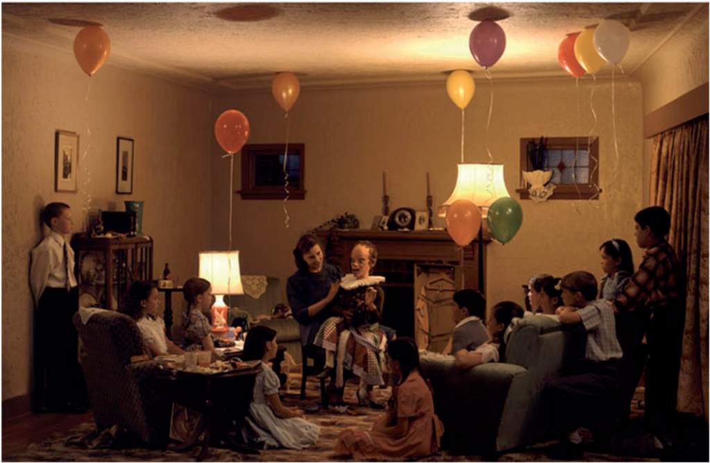
Figure 7. Jeff Wall: "A ventriloquist at a birthday party in October 1947," 1990. Transparency in lightbox, 229 × 352.4 cm.

further gives view on a tiny fourth figure hiding in the distance. Also looking to the camera, she inhabits the shy posture of a pigtailed schoolgirl, presenting her body in profile (support leg, free leg). Triggering the nightmarish image of being isolated and laughed at that provokes the viewer's projection and identification, the image merges the positions of the mocked outsider in front of the image with the ridiculed outsider inside the image. Thinking back to Weegee's "Boy at Circus," it seems as if the stage has here been turned by 90 degrees, now mirroring a laughing audience while at the same time throwing its viewer into an embarrassed and infantilizing position in the middle of the ring. Peter Handke's play "Offending the Audience" also springs to mind. It operates with speech acts and direct address to provoke some kind of Brechtian alienation effect. Sherman's display of theatrical methods is therefore far more complex than most "staged photography" because it acts out different performative levels to disrupt any unity of