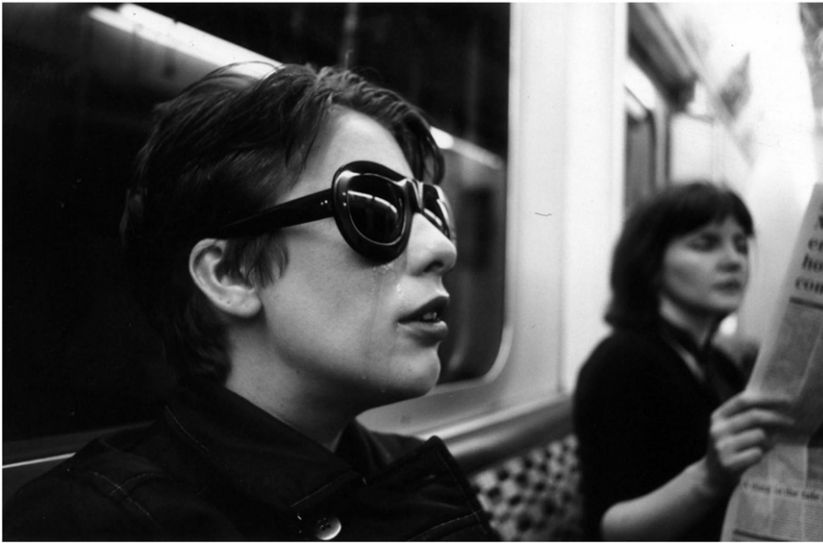
Figure 6. Hayley Newman: "Crying Glasses (An Aid to Melancholia)," from the series Connotations , 1995. With permission of the artist.