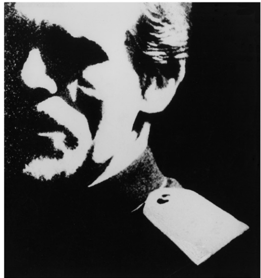
Figure 4. Josef Koudelka: Czechoslovakia, Prague, 1966, Theatre Divadlo za Branou (Beyond the Gate), The Three Sisters , play written by Chekhov and directed by Otomar Krejča. Magnum Photos.

Sitting next to a father figure, the boy’s forehead overlaps the man’s lower face, while the boy’s upper face is covered by the opera glasses so that their two faces almost read as one. Both figures wear seeing devices, making it impossible for me to see their eyes. My encounter with the photograph therefore ultimately becomes about watching, enhanced by the triangle of sightlines operating in the picture that intertwine and extend their gazes beyond my point of view. The boy’s laughter is aided by a mechanical eye – just as the expressions