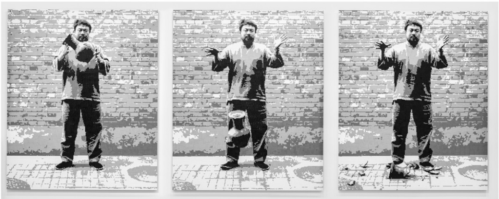
Figure 9. Ai Weiwei: "Dropping a Han Dynasty Urn," 2015, LEGO bricks (from the original 1995 photographic triptych by the artist), 230 x 192 x 3 cm.