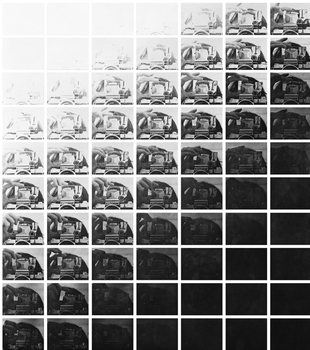
Figure 5. John Hilliard: “Camera Recording Its Own Condition (7 Apertures, 10 Speeds, 2 Mirrors),” 1971. Original study, silver gelatin photo on museum board, 61 x 56 cm.

interpreted, but also the different participants and off-frame agencies that contribute to the changing situation of production and reception. The different pro-photographic layers involved in the construction of a photograph of this kind are described by