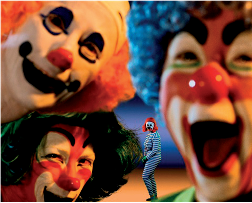
Figure 8. Cindy Sherman: Untitled # 425 , 2004, color photograph, 182.9 x 236.2 cm. Copyright Cindy Sherman. Courtesy of the artist, Sprüth Magers, and Metro Pictures.