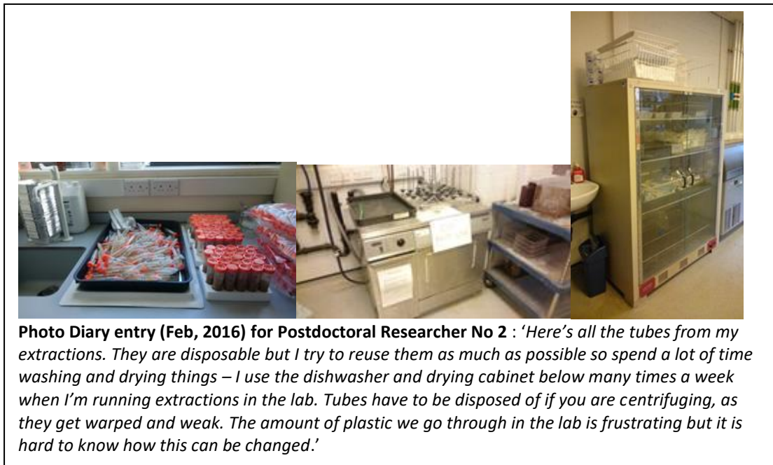
Figure 3. Photo diary entry discussing use of plastics and methods used for re-use.

held outside of work. However, it also has implications for how these are shaped by both institutional and national policies and procedures. For instance, in the quote above, 'Postdoctoral researcher No. 2' discusses their green values and how they try to translate them into the workplace. Figure 3, a diary extract from the same participant, shows how such green values can sometimes create conflict with the day-to-day workings of what it is to be a 'good scientist'. In particular, here they reflect on the frustrations of using disposable plastic during their laboratory work, and the methods they use to try to reduce the waste. However, in trying to save plastic, they increase their use of the dishwashing machine and drying ovens, thus potentially leading to increased electricity consumption.