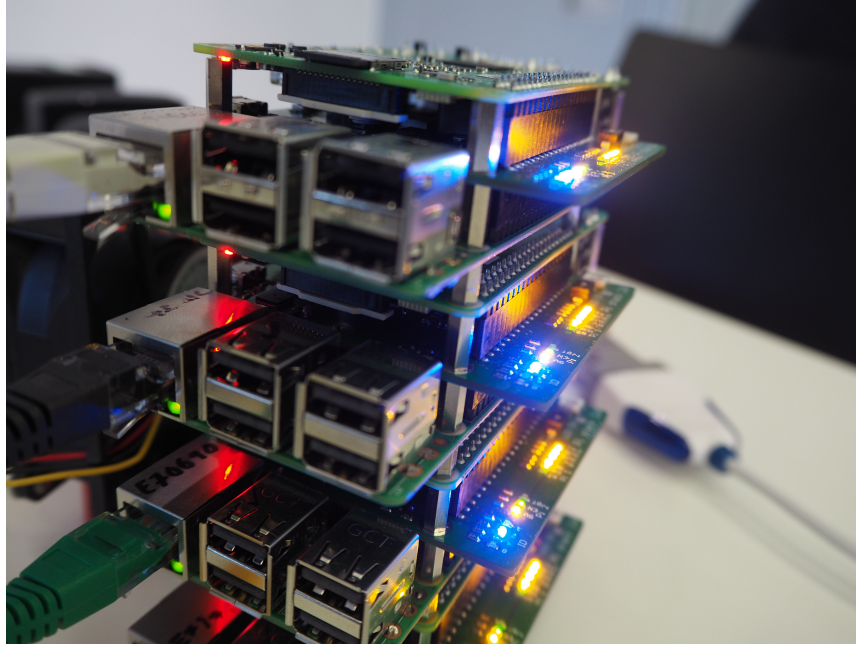
Figure 2: A micro data centre comprising a cluster of Raspberry Pis that was assembled at the University of Glasgow, UK. These data centres in contrast to large Cloud data centres are low cost and low power consuming.

data centres with millions of cores,' is now moving towards 'millions of data centres with dozens of cores.' These micro data centres are novelty architectures and miniatures of commercial cloud infrastructure (see Figure 2). Such deployments have become possible by networking several single board computers, such as the popular Raspberry Pi [9]. Consequently, the overall capital cost, physical footprint and power consumption is only a small fraction when compared to the commercial macro data centres [10].