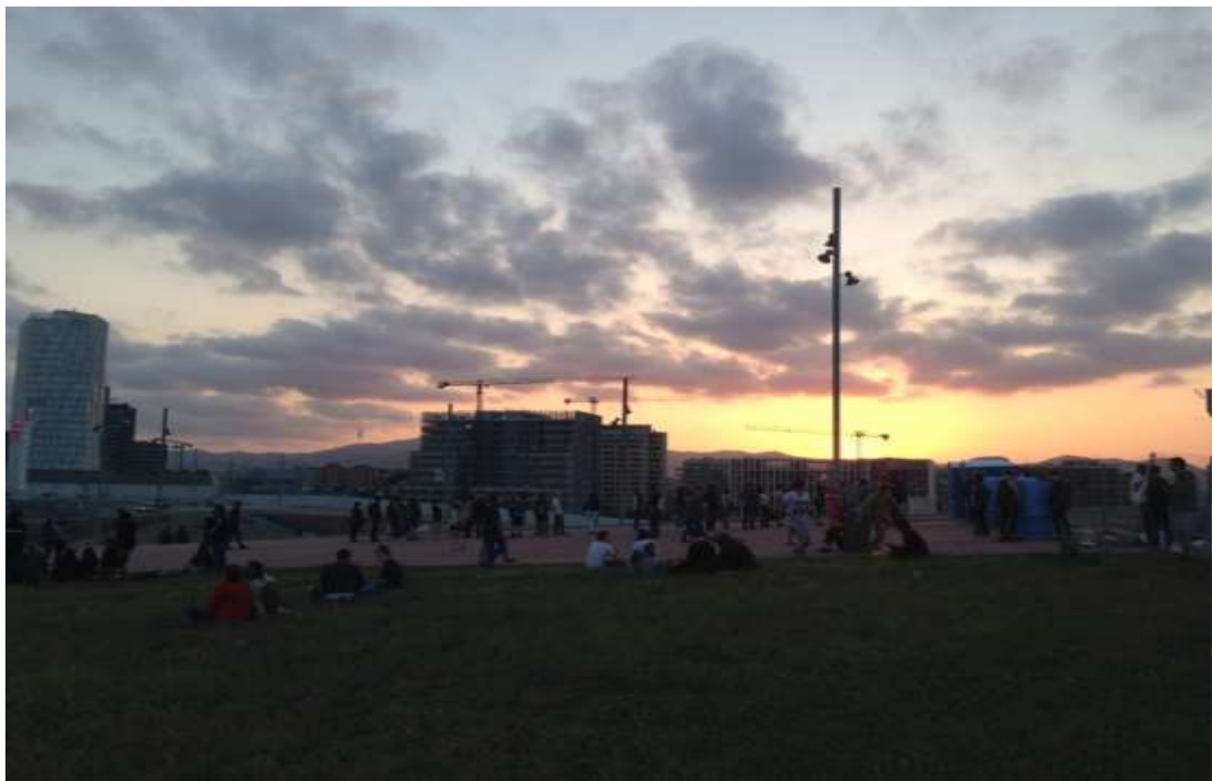
Figure 2. The urban and industrial aesthetics of Primavera