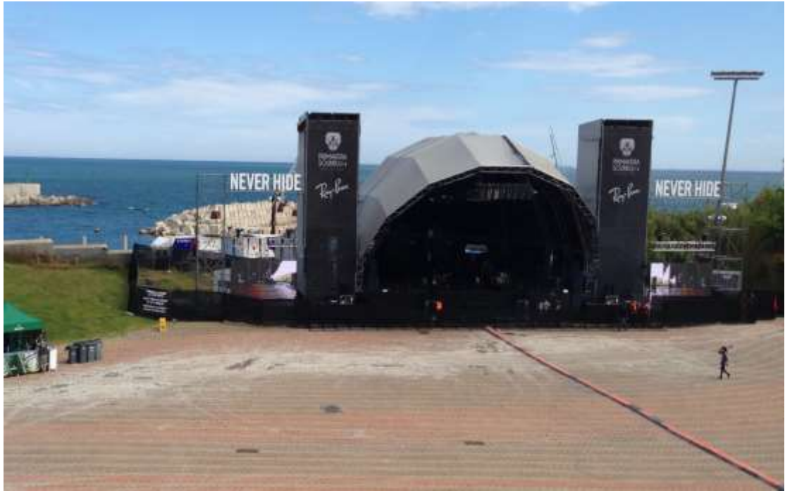
Figure 1. The sponsor-oriented names of festival stages