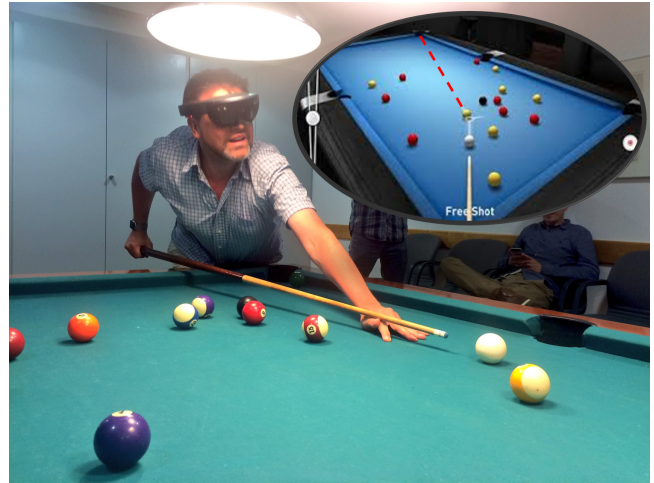
Figure 1: Envisioned augmented snooker by wearing HoloLens where the inset figure shows guidelines and estimated path.

To tackle this research problem, we propose a framework that utilizes commodity wearable devices such as head-mounted display and smartwatch, for both displaying the guidance and for capturing and correcting novices posture and action in real-time. This system could be adapted to most of the sports that involve wrist motion,