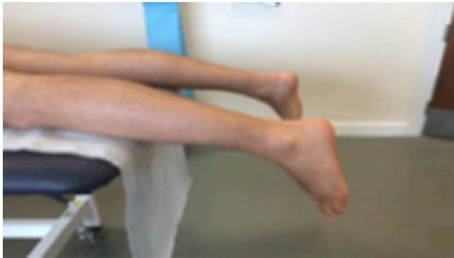
Figure 1 Standardised position for ultrasound imaging of the Achilles tendon.

participants were scanned in series by all 6 consultants within the same session. To control for changes in tendon loading that may affect vessel signal, participants were instructed to avoid heavy sporting or loading activity 24 hours prior to repeat examinations.