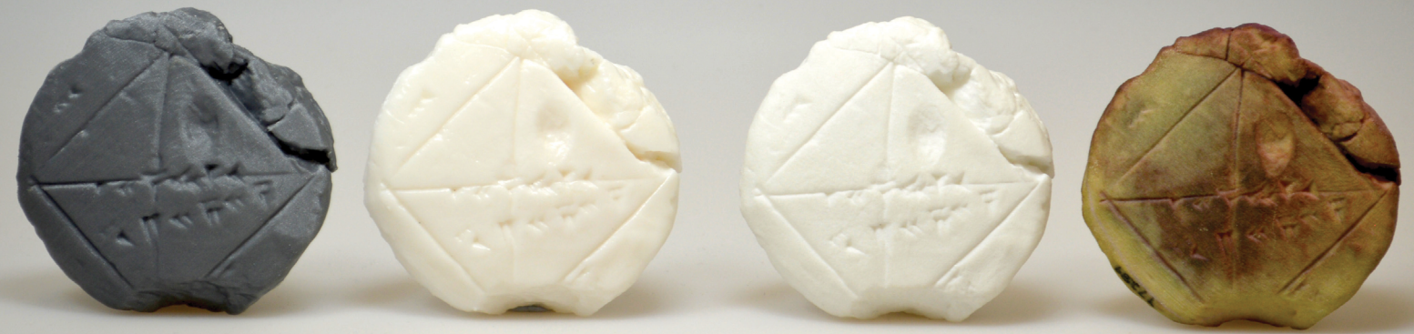
Figure 3 Left to right: fused-deposition PLA print; stereolithographic resin print; laser-sintered nylon print; gypsum print.