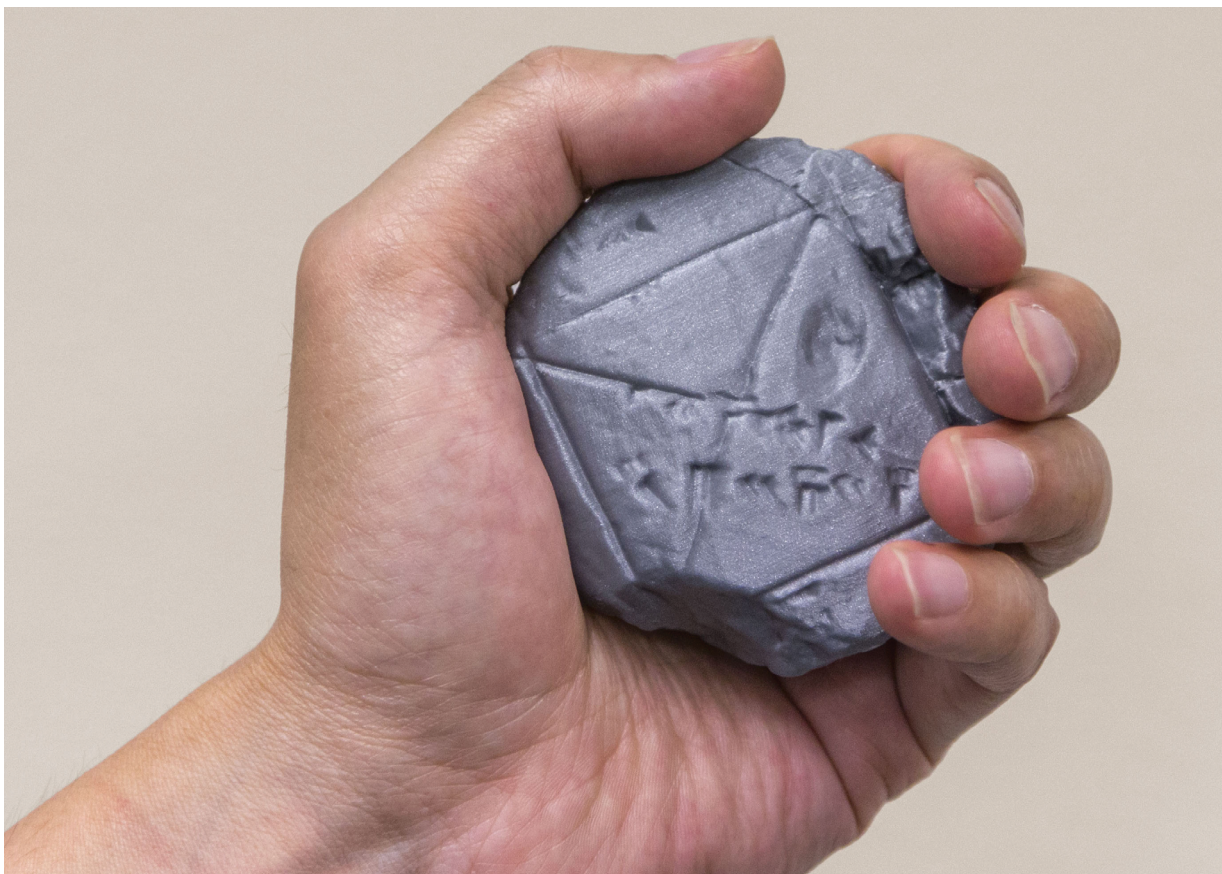
Figure 4 Discovering by touch and grasp that the tablet does not nestle into the palm without fingers getting in the way of writing, at least in this adult hand. Would it fit better into a child's hand, or are we holding it wrongly?

There is information in the deep holes that transcription avoids (except by dots that indicate some kind of damage). A large crack looks to have formed along one of the square's sides. The sheer drop next to it – visibly undercut on the SL resin and SLS nylon prints, but