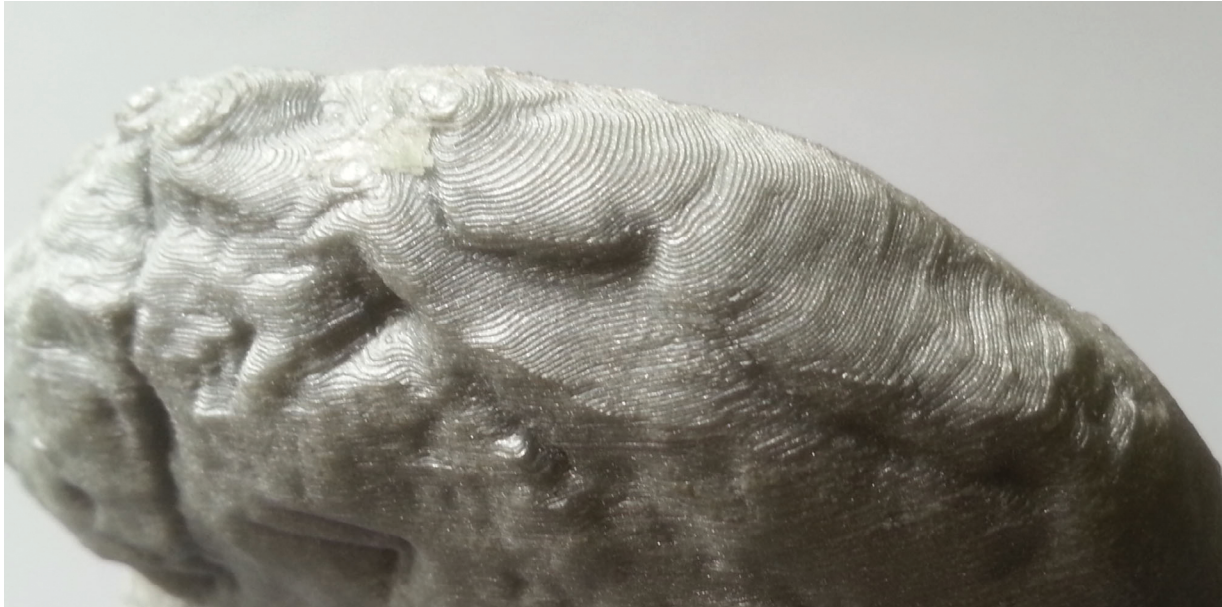
Figure 5 A technological mediation artefact: print layers visible as topographic contours at an ‘end’ of the FDM print.

partially filled-in on the FDM print – gives the impression that the clay broke where the stylus weakened it. Such a reading accords with interpretations of many other broken tablets, notably where the clay is understood to have been heavily stressed by erasure and rewriting. 18