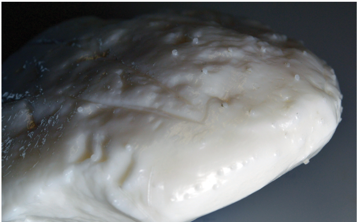
Figure 2 Reverse of the SL resin print with bumps left after breaking the scaffold away.

When exterior surface representation is the primary goal of 3D printing, thick objects, such as this tablet, are commonly printed as hollow shells. Holes can be left to drain out unused resin for recycling in subsequent prints. Rather than compromise our surface, we chose to solidify the innards completely. We also hoped that the retained resin's weight would communicate the solidity of the clay original.