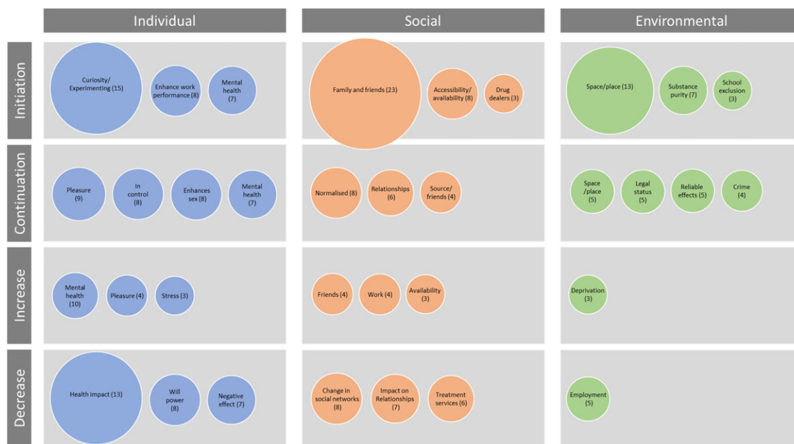
Figure 2 Coding of themes (no. of sources) presented by influencing sphere and critical change point [Colour figure can be viewed at wileyonlinelibrary.com ]

[22,37,38,40,56,64,68,71]. Participants in Ojeda et al. 's study of Mexican men being deported from the United States used ATS to help them manage exhaustion when working long hours [64]. A similar message emerged in research from Boeri et al. examining the trajectories of current and ex-methamphetamine users in a North American suburb [22]. Participants described being encouraged to use ATS by co-workers to increase energy levels. In addition to enhancing performance, Sherman et al. 's study in Thailand linked ATS initiation to hunger reduction at work [68].