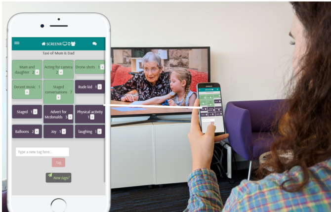
Figure 1: Screenr usage in the home

commentary on people appearing in the show. Indeed, Scarborough and McCoy [23] suggested that viewers who report more moral (and, by implication, more ‘critical’) reactions to reality TV were less likely to actually watch it. Coupled with the essentially negative portrayals reality TV deals in, the tendency for reality TV to produce uncritical viewings in the majority of its audience is problematic. Given reality TV’s primary purpose as entertainment, we are motivated by the previous work of Tremlett [25] who has noted how uncritical viewings of reality TV shows often accentuate the differences between the viewer and those on screen, leading to the entrenching of negative stereotypes and stigmatisation. In this way, reality TV can serve to undermine the lives of those that it claims to document, and problematically provides justification for their ongoing ‘othering’ and stigmatisation.