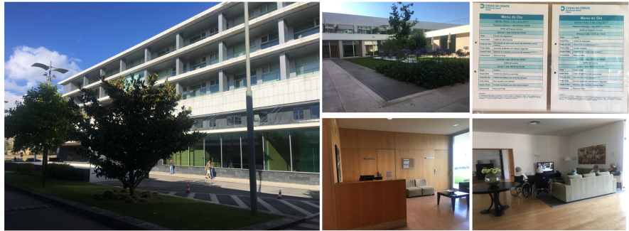
Figure 2. Medical safe housing in Lisbon, Portugal.

the inside and outside the house is designed to be “BF” (barrier-free). In other words, steps outside the house were removed for an easier access to the complex and the corridor in the building was widened so that wheelchairs could be moved in both directions freely. It gives the maximum consideration to the senior who have difficulty in moving. Medical Safe Housing is designed in accordance with the newly established guideline and it is actively linked to various ongoing services such as the care service group in the house, the home nursing system and the daycare center. In our paper, we take this concept of medical safe housing for the future development of senior retirement community.