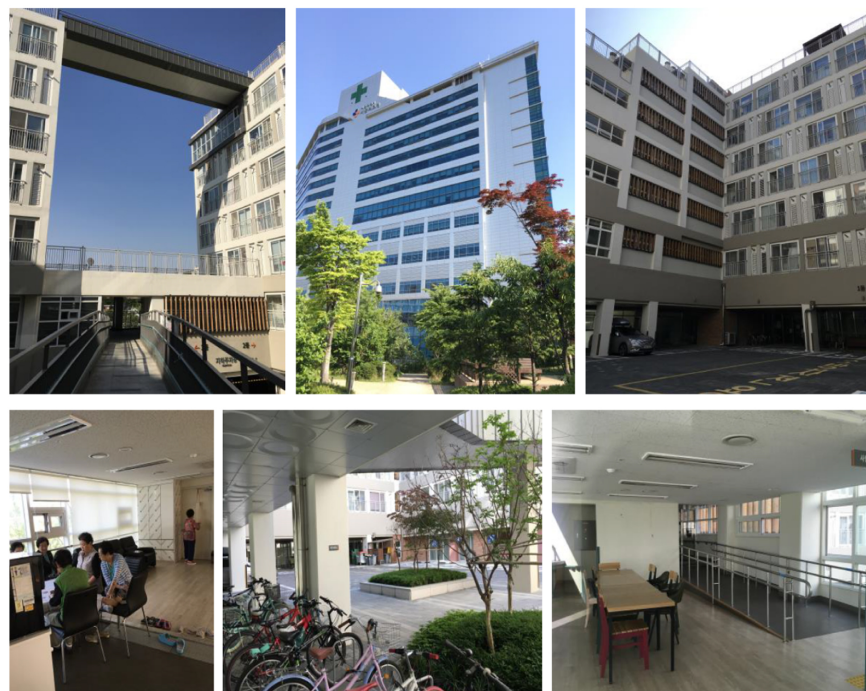
Figure 1. Medical safe housing in Seoul, South Korea.