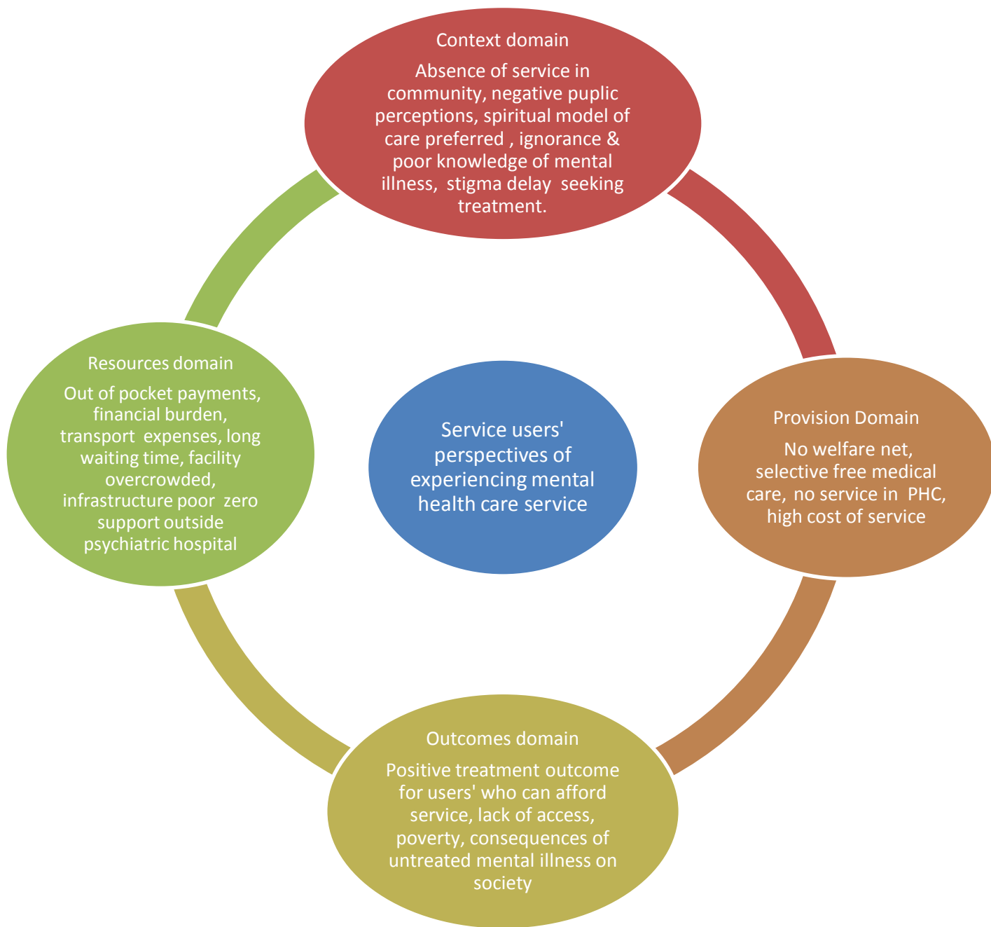
FIGURE 3: Service user's perspectives of experiencing mental health care service