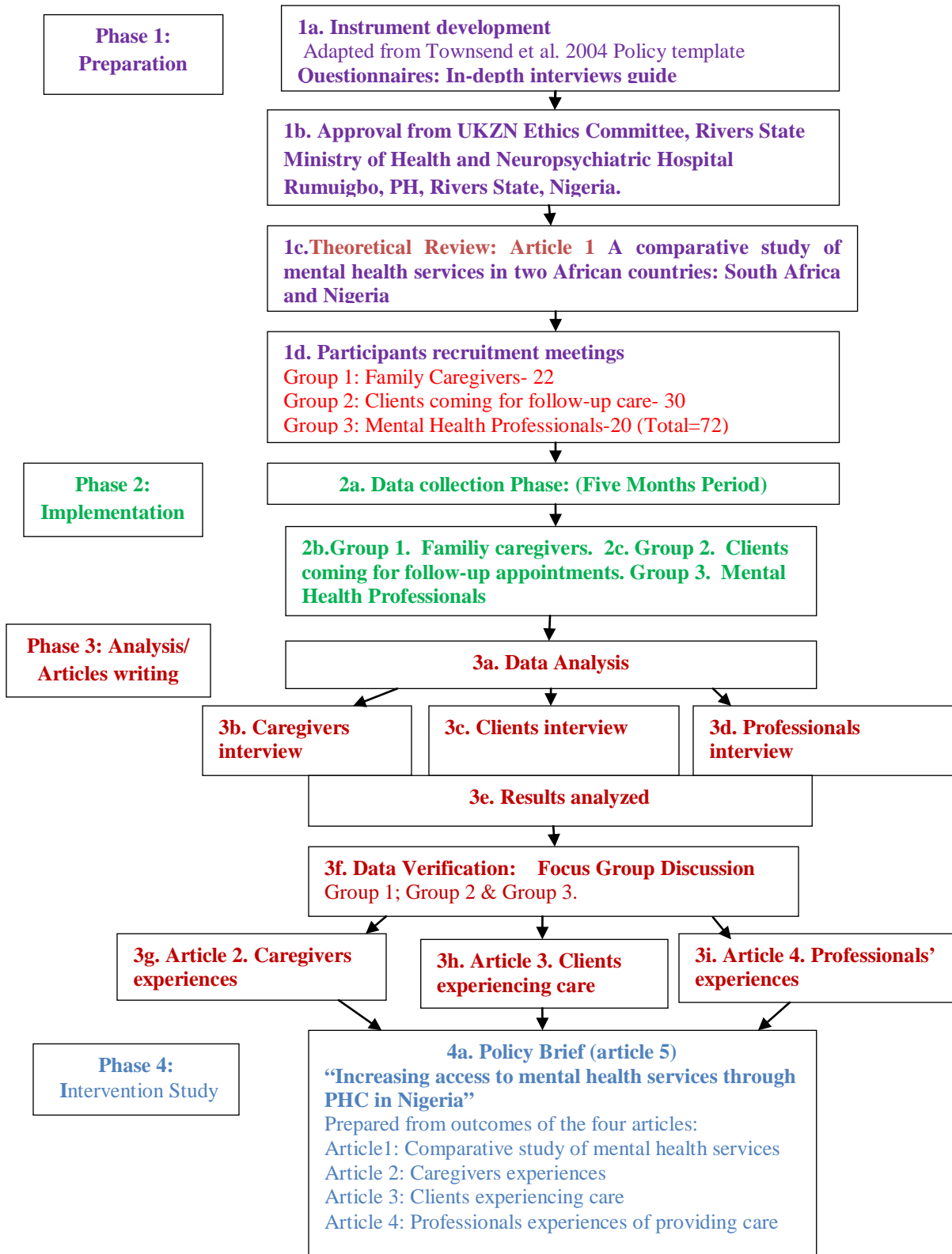
FIGURE 2.1: Outline of study phases