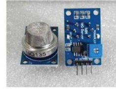
Fig. 4. Air Quality Sensor (MQ135)

Some very dangerous gases, e.g., ammonia (NH 3 ), nitrogen oxides (NO x ), benzene, alcohols, smoke, CO 2 , and other harmful gases that significantly affect air quality can be detected with the MQ 135 sensor. Therefore, this was chosen and is illustrated in Fig. 4.