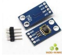
Fig 1. Temperature and Humidity Sensor (SHT11)

The SHT 11 sensor was chosen because of its excellent sensitivity and is shown in Fig.1: