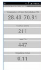
Fig. 8. Smartphone Application

The application development will be carried out using SDK (software development kit). Figs. 8 and 9 illustrate the prototype of this system.