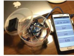
Fig. 9. Smartphone Apps Running on Samsung Android