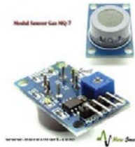
Fig. 3. CO Sensor (MQ7)

Monoxide gas is produced by motor vehicle fumes, to detect this the MQ 7 sensor was selected and is shown in Figure 3.