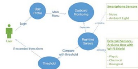
Fig. 7. User interaction with Smartphone applications

The smartphone applications to be developed are expected to be executed on the Android, iOS, Windows, and BBOS platforms. Users must log in to get all the facilities, including information on the environmental factors and the early-warning threshold levels. A diagram of user interaction with smartphone applications is shown in Fig. 7.