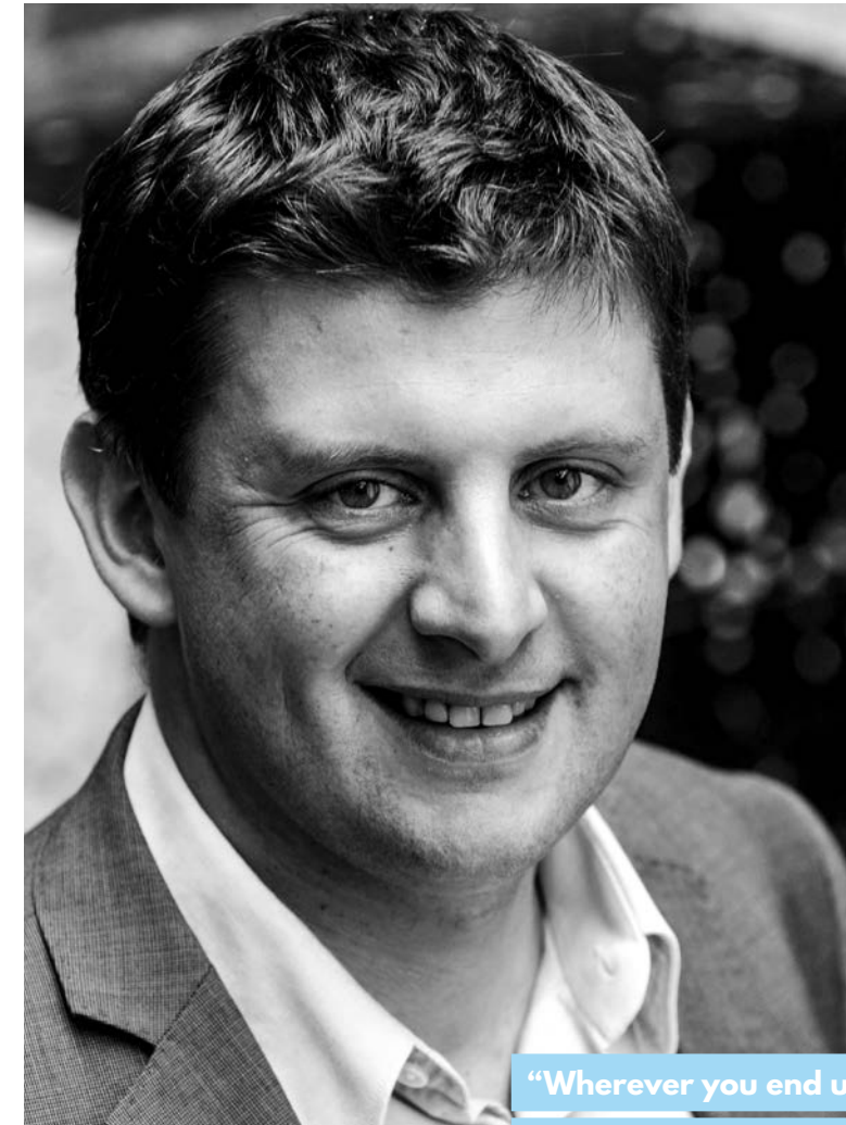
John Crombez SP.A Chairman

“There is certainly a place in politics for PhDs, too. A ministerial cabinet is always looking for employees who are able to combine two things: one, they should be able to assimilate or process a lot of information in a short time and, two, they should be articulate enough to clearly communicate this information. This has not always been an easy combination to find. It's not because you have a PhD and because you are also able to process a lot of information that you also have the skills to clearly and understandably explain everything. PhDs often internalise their knowledge and find it hard to communicate it to the outside world; while the non-academic labour market, and certainly the political world, is looking for precisely those people who can combine both these skills. It is important to disseminate and share information, but it is also important to analyse information and determine what is relevant to society based on that. The fact that you are good at interpreting statistics does not necessarily mean that this should also have policy implications. No matter how you look at it, PhDs are always well-equipped to have these analytical insights.”