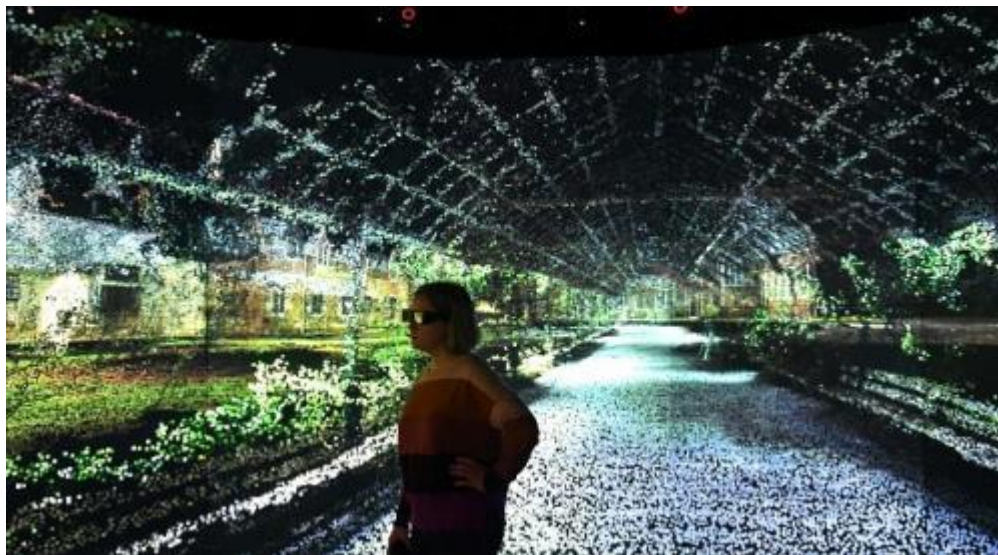
[Fig 3. Parragirls Past, Present 2017 [viewer in immersive 3D film]

The film voiceover, created and spoken by the women, emerged through initial experiments in which they roamed the site in pairs, recording their conversations, and comparing memories and perceptions. Thus, the voiceover is less a narration for an imagined audience, than an emergent discussion. As with Awkward Conversations , the aesthetic technique was intended to promote a process of elaboration within a holding space—with the distinction that in this case, the facilitating environment had to be engendered within the walls of the Parramatta site. It is in this very profound sense, that Parragirls Past, Present differs from objective (or sensationalising) reports of the site’s notorious past. The aim—and unique capacity—of the immersive film as an arts-based psychosocial inquiry was to locate the continuing effects of trauma in present day interactions. It is in this way that we come to understand the force of institutionalised discourse.