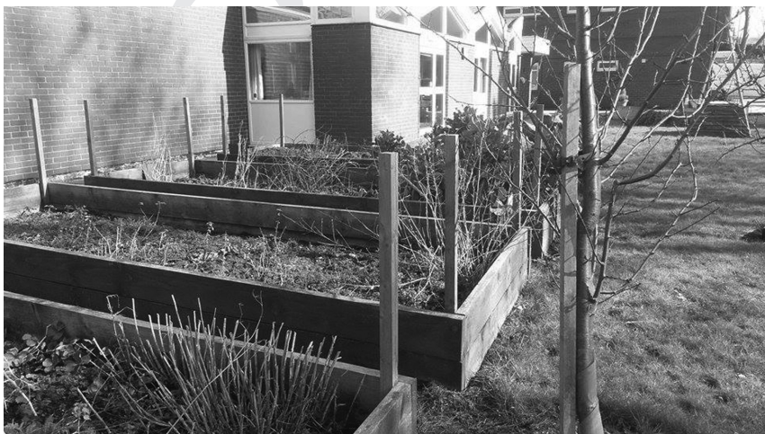
Figure 9.3 Neglected raised beds in Todmorden

A third negative perception reported surrounded the placement of raised beds on busy pavements (see Figure 9.4). Some residents believe that the raised beds on public footpaths are an obstruction and should not be there. A Todmorden resident gave their views about the raised bed along pavements: