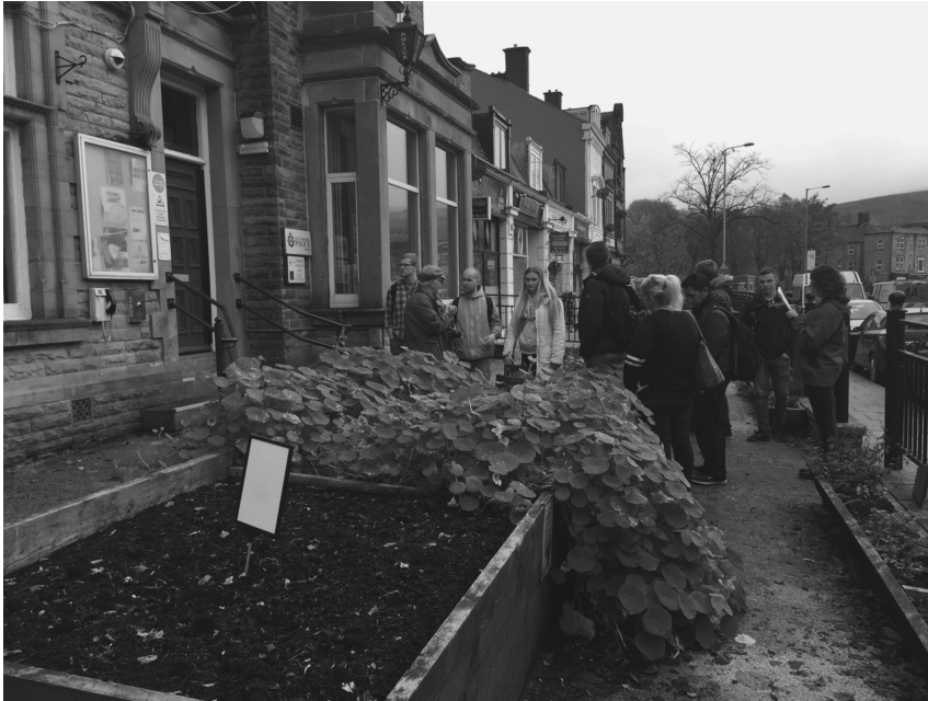
Figure 9.2 Raised beds at Todmorden train station