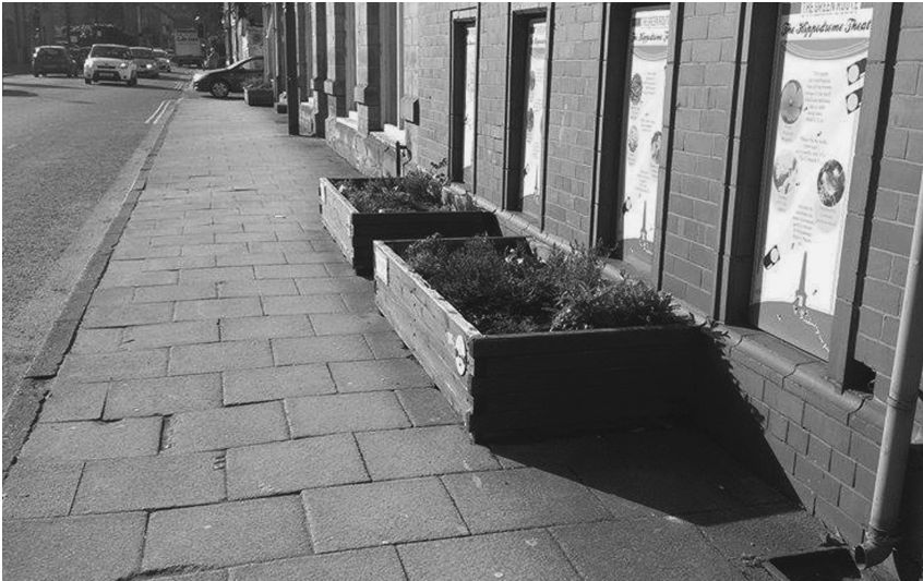
Figure 9.4 Raised beds on a pavement next to a busy road

Some [raised beds] I don't think should be there, like on public foot paths where they are obstructions and obstacles on the footpath, like outside the Hippodrome [Theatre] they take up quite a bit of room and are obstacles for people with disabilities or with prams ... the planters need to be tended to more to keep them looking nice and some of these on the pavement could do with removing, I don't agree with them at all, pavements are for walking on not for growing things.