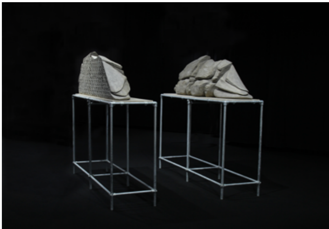
Figure 1. Claustra; stoneware 1.8 x 2.0 x 1.8 m, 2015.