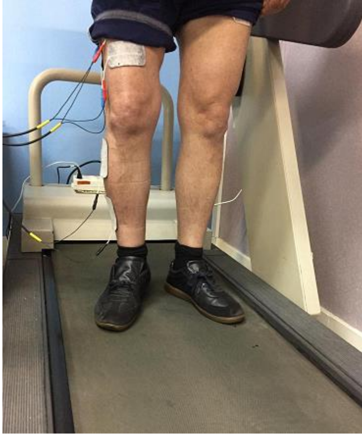
Fig 3. Functional electrical stimulation and treadmill walking.