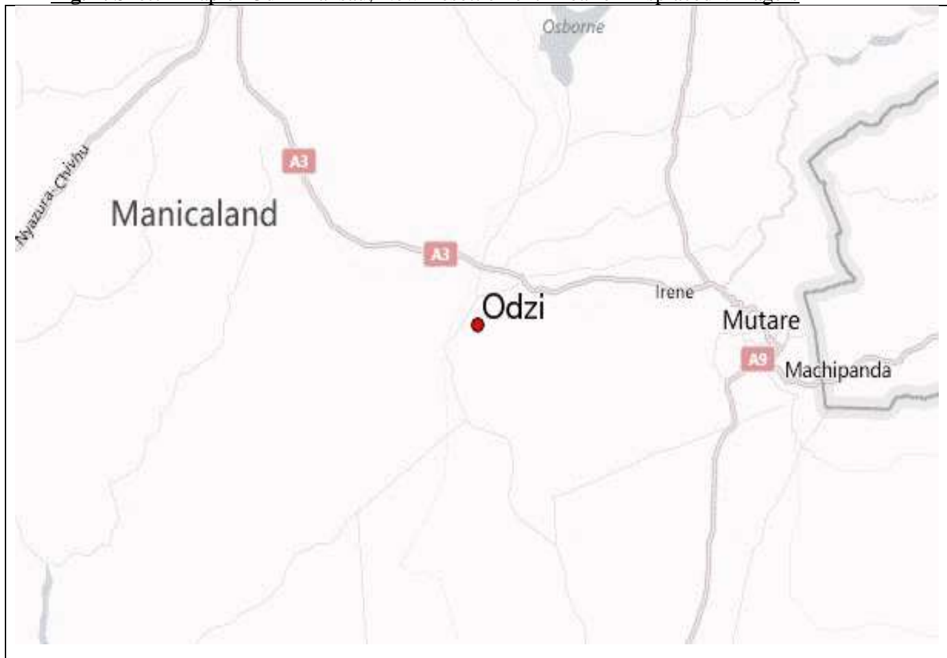
Fig. 2. Sketch Map of Odzi Transau, New Resettlement Area for Displaced Villagers