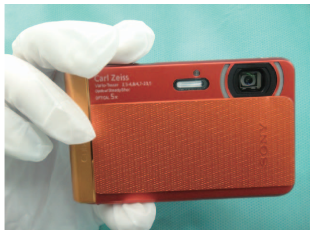
Fig. 1. The Cyber-shot DSC-TX30 camera. The surgeon holds the camera in one hand, which is covered by an extra sterile glove over the surgical glove.