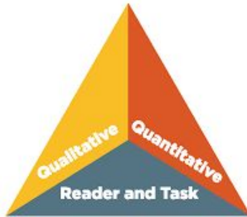
Figure 1. The Standards' Model of Text Complexity.

Engagement with texts. Another important aspect that teachers need to keep in mind when selecting texts for their curriculum is students' engagement with the text. Rosenblatt (1967/2005), a theorist known for her studies regarding readers and their responses to literature, asserts that "...the teaching of reading and writing at any developmental level should have as its first concern the creation of environments and activities in which students are motivated and encouraged to draw on their own resources to make 'live' meanings" (p. 27). Rosenblatt's (1967/2005) assertion opens up a discussion on the value of students' level of engagement with texts, a conversation that is still continuing today.