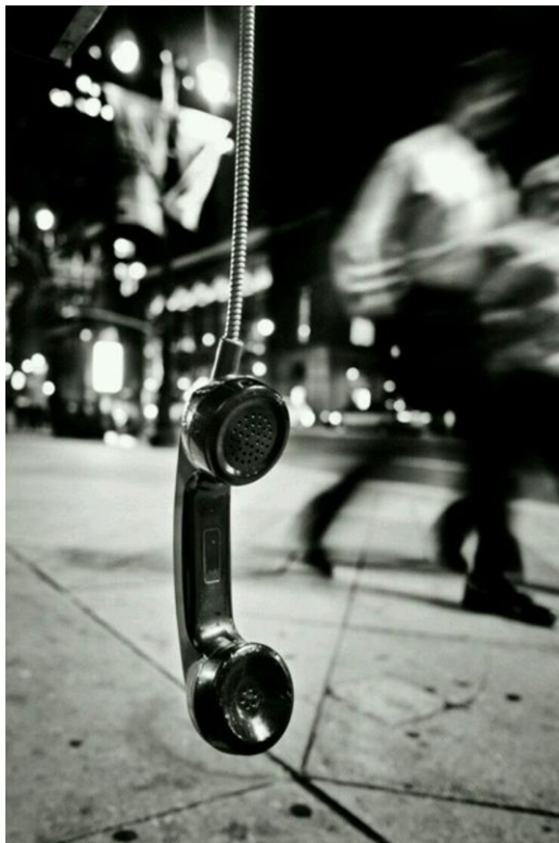
Fig. 1 7

can appear either static or blurred in the resultant photograph. In Fig. 1, the two people appear blurred partly as a result of the depth of field but, more significantly, because a long exposure was used. We know they were moving when the photograph was taken because the telephone is sharp – if the blur was due to camera movement then the telephone would likewise appear blurred. Thirdly, by carefully choosing exposure and lighting the photographer can effectively remove fine detail from the resultant photograph. Judging by the poor condition of the rest of the telephone in Fig. 1 it is likely that the whole of the front of the earpiece is likewise scratched and chipped. But the photographer has effectively removed these features by the choice of exposure and lighting. In all three of these cases, the choice of camera settings completely changes the aesthetic qualities of the resultant photograph and, importantly, these changes occur at the level of fine detail and not across the whole photograph uniformly.