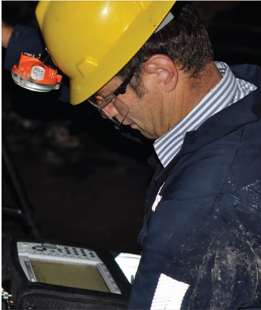
Figure 2. Measuring RF signal level.