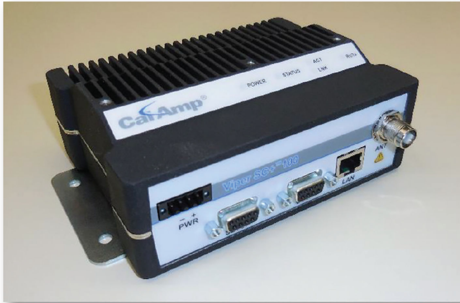
Figure 1. CalAmp Viper SC+ data radio.