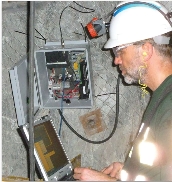
Figure 5. Evaluating wireless link performance.