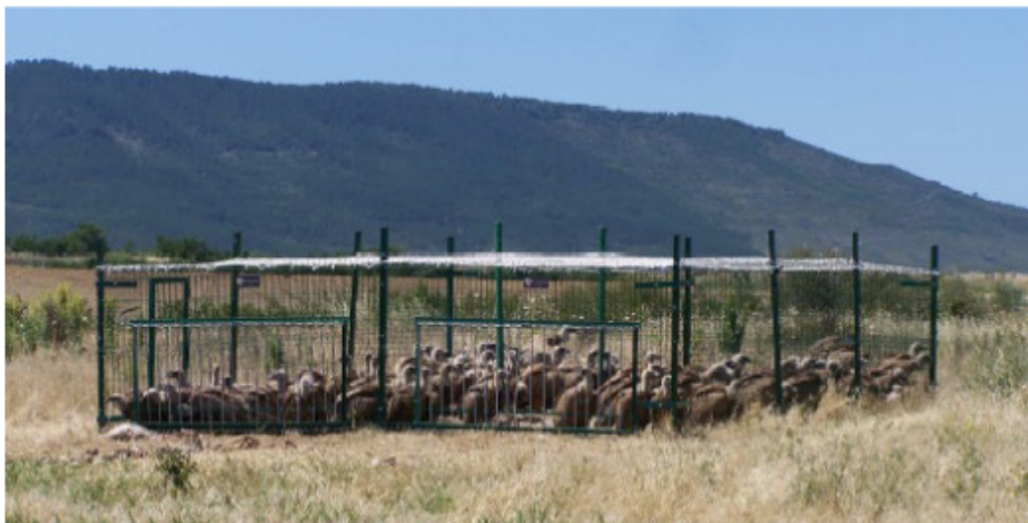
Fig. 2. Trap designed for scavenger birds.

Fig. 2. Trampa dissenyada para aves carroñeras.