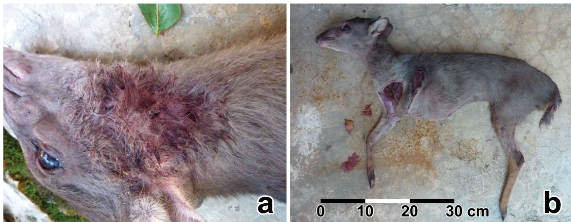
Figure 1. The blue duiker carcass collected after chimpanzees completely abandoned it (a) Close-up of the cervical region. Two wounds likely made by leopard canines can be seen on the throat. (b) Full body. The left foreleg, right hind leg, and intestines are missing (either eaten or discarded by the chimpanzees), but other parts are mostly intact.

At 12h24, the alpha male, Primus, descended to the ground and pulled the duiker back into the tree. He sat on a large bough and inspected the carcass, while Zola and Christina were approaching him. Blood was still oozing from the duiker's throat, and Primus took some time to investigate the abdomen with his fingers and mouth. During this time, we were able to observe the duiker's fully descended testes and thus identify it as an adult male.