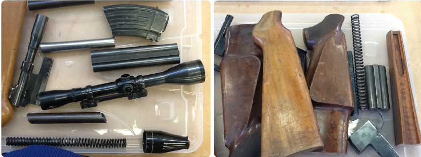
Figure 3: Samples of the material available for the project.

Western Australia State Police Department often decommissions fire weapons for diverse reasons. Those pieces of equipment are dismantled, sectioned as to become unutilized for their primary function. The pieces present irregular sizes and vary from parts of wood handles and forestock, metal barrels, metal telescopes, among others, and they were found to be an opportunity for design.