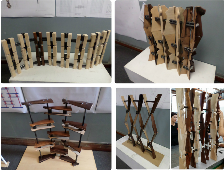
Figure 4: Means-oriented design final models.

Documentation; Pieces and Joinery; Redesign and construction decisions. From thirty-one cardboard proposals, only those five further developed using the real pieces were considered into 'Redesign and construction decisions' category.