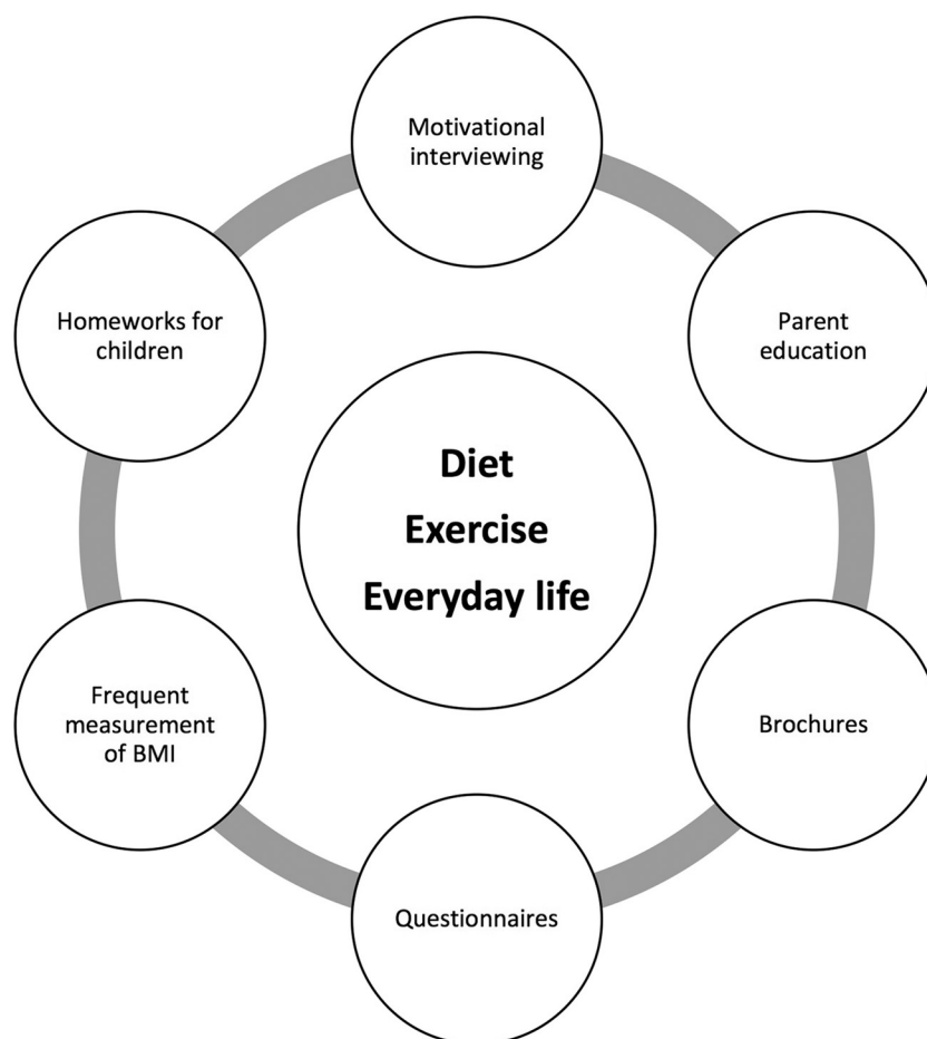
Fig. 2. Components of the intervention (Bern, 2013).

it down on a chart. The intervention was intended to stabilize BMI rather than ensure the child lost weight. It was also intended to improve parenting skills like implementing rules for family meals, and children's nutritional and exercise habits. Physicians made folders for each participant, into which they placed the measurements they recorded and all questionnaires about the participant.