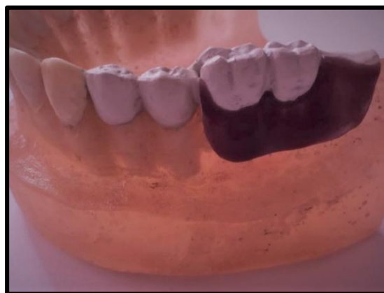
Figure 2: full coverage PEEK crowns with lingual ledge attached to it cast OT CAP unilateral attachment and Then thermoplastic PEEK material unilateral partial denture with Visio.lign for buccal flange

Group 3: On the reduced premolars, full coverage PEEK crowns with lingual ledge attached to it OT CAP unilateral attachment were constructed. Then thermoplastic PEEK material unilateral partial denture with Visio.lign for buccal flange was constructed as for Kennedy class II cases.