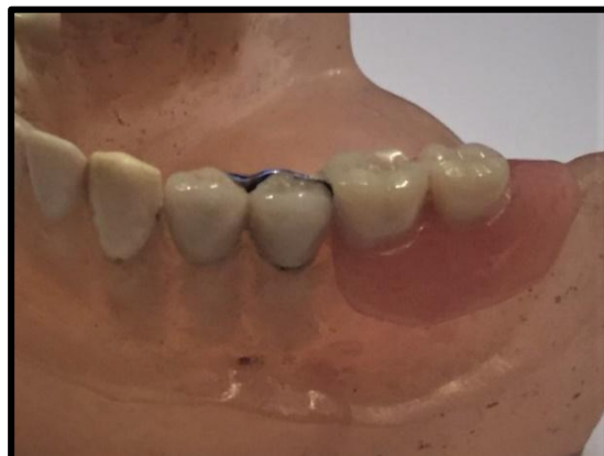
Figure 1: Full coverage metal crowns with lingual ledge attached to it cast OT CAP unilateral attachment, and unilateral metal cast partial denture

second premolars were reduced and prepared for full coverage metal crowns with lingual ledge attached to its cast OT CAP unilateral attachment* (OT Unilateral, Rhein 83srl, Bologna, Italy). Then unilateral metal cast partial denture* (Cobalt-Chromium metal framework, vita, Switzerland) was constructed as for Kennedy class II cases according to the manufacturer's instructions.