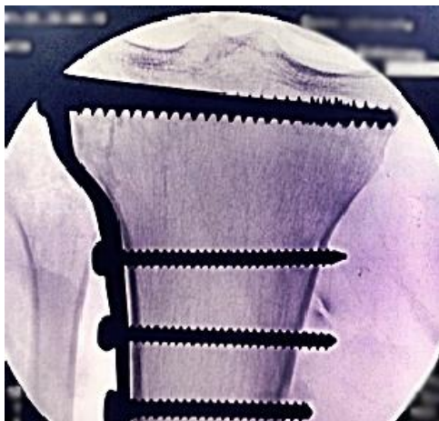
Figure 5: Intraoperative photo from the image intensifier after fracture reduction and fixation by plate and screws

While, in the presence of a comminuted articular surface, or unstable fracture pattern, plate and screws were used for fixation as this added more stability (Figure 5). They were inserted using minimal skin incisions. Iliac crest graft was used in 21 cases.