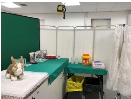
Figure 1. A rabbit feeding tube practical station, with stuffed rabbit toy as a simulation patient.

Human medical professionals have an important advantage over veterinary educators as they can use actual patients in their examinations. Medical actors can be used to simulate patient interactions, with scripts so that each student faces exactly the same scenario, ensuring each student has the same assessment experience. Whilst animals are sometimes used in the assessment of physical examination skills, assessors need to ensure there is consistency throughout the assessment so that later students are not disadvantaged by patients becoming fatigued. More importantly, they also need to ensure the welfare of the animals being used in the exam. Not many cats will tolerate repeated physical examinations and no animal should be subjected to unnecessary procedures simply for an educational assessment, so in veterinary education we are often reliant on animal models (Figure 1).