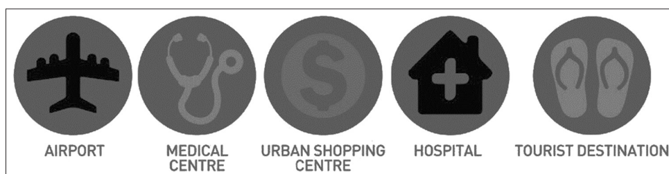
Figure 1: Sample study sites representing multiple pharmacy practice setting

The letter P followed by 0 and number 1–5 presents the five practice locations in which the interview was conducted.