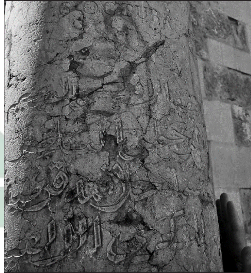
Figure 6. The Arabic Script on a Marble Pole in Cordoba

Here, the Arabic script is written below the latin script of the Spanish language. This bilingual sign shows that Spanish was used hand-in-hand with the Arabic script. Moreover, as this pole is located in a walkway, all people may have an access to it. It demonstrates that the creator of the pole wanted to communicate with the passers-by. Hence, it was not only the government that prescribed both Arabic and Spanish as languages for communication, but also people who used both languages in their communication. This situation is different from the LL of Spain today, where Spanish is the only official language.