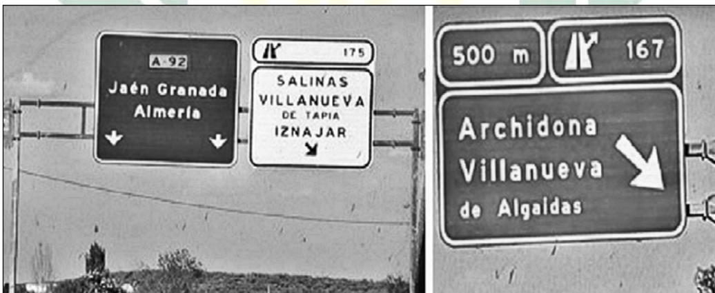
Figure 1. Road Signs in Andalusia's Highways

The government policy that puts Spanish as the only official language has a great impact on this cluster. Spanish language dominates signs in public spaces. Arabic inscriptions literally cannot be found in public spaces in the Andalusia province. With regard to road signs, all are written in Spanish using Latin characters.