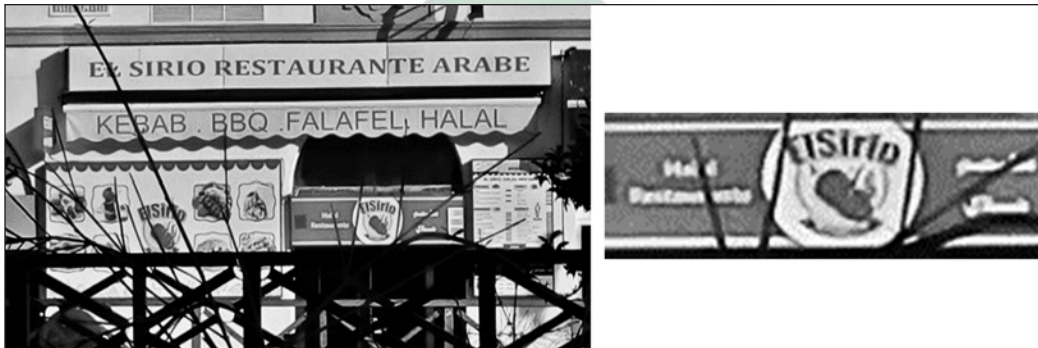
Figure 9. The Arabic scripts in the El-Sirio Restaurant

subordination. All human beings are equal before God; Only Him who are superior. Hence, there is a transformation of social structure in the mosque, and the inscription of “ Wa laa ghaaliba illa Allah ” helps them to share collective identity.