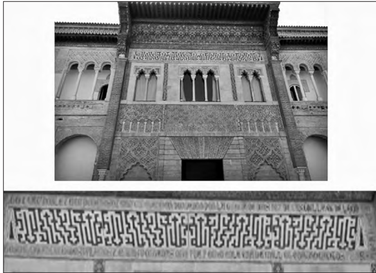
Figure 3. The Alcazar of Sevilla

of the palace's walls. This also shows their humbleness in front of God, as well as their high expectation of Allah's mercy. Identical