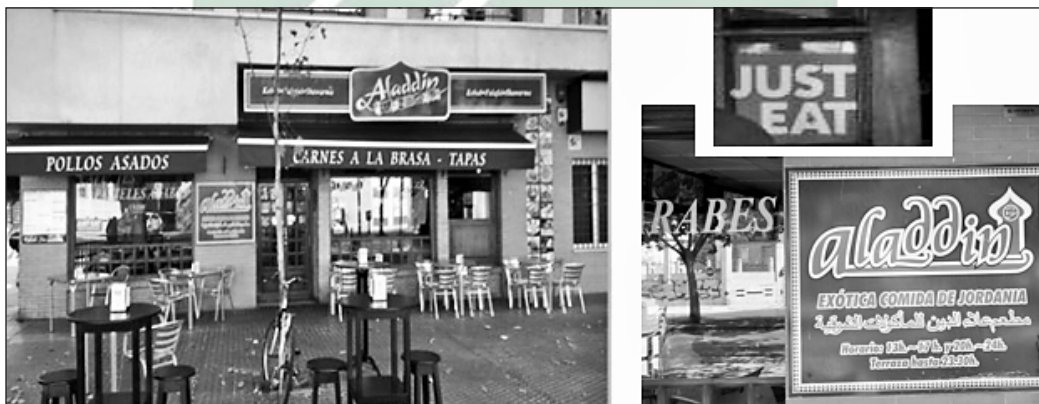
Figure 10. The Arabic Script in the Aladdin Restaurant, Sevilla

written in big fonts, hence, become the point of attention. These are even more conspicuous than the name “Aladdin” itself. This implies that this restaurant expects its largest customers from the Spanish community. Near the entrance door is a red board containing Latin and Arabic scripts (second picture in Figure 10).