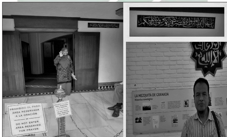
Figure 8. The Arabic Scripts in the Mosque

The second calligraphy is put outside of the main building. The calligraphy says, “ Wa laa ghaaliba illa Allah ”, which means “And no conqueror except Allah.” As it is put outside of the main building of the mosque, the Arabic inscription might be intended for both Muslims and non-Muslims who can understand Arabic. To Muslims, the inscription of “ Wa laa ghaaliba illa Allah ”