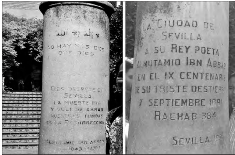
Figure 5. Arabic Script in a Pole in the Backyard of the Alcazar of Sevilla

The script is engraved on the pole/column and thus it does not easily vanish although it was written a long time ago. The date of the life of Almu'tamid ibn Abbad' (1043-1095) is also engraved there. A member of the Abbadid dynasty, he was the third and last ruler of the taifa of Sevilla in the Andalusia. On the column, the Arabic script is positioned on top of all other scripts written in Spanish. This shows that the Arabic was the most important thing at the time of the inscription. The Spanish written below it is ' No hay mas dios que dios. ... resurreccion ' which means 'God decreed in Sevilla dead in our open graves in the resurrection.'