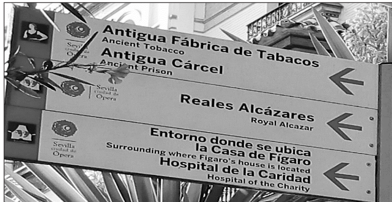
Figure 2. A Road Sign in Sevilla

Similar to road signs in highways, road signs inside the cities of Andalusia are also written in the Latin Alphabet, and none is printed in Arabic alphabet although some of the toponyms and words are from the Arabic vocabulary. The word alcázares in Figure 2 is from the Arabic alqashr which means fortress.