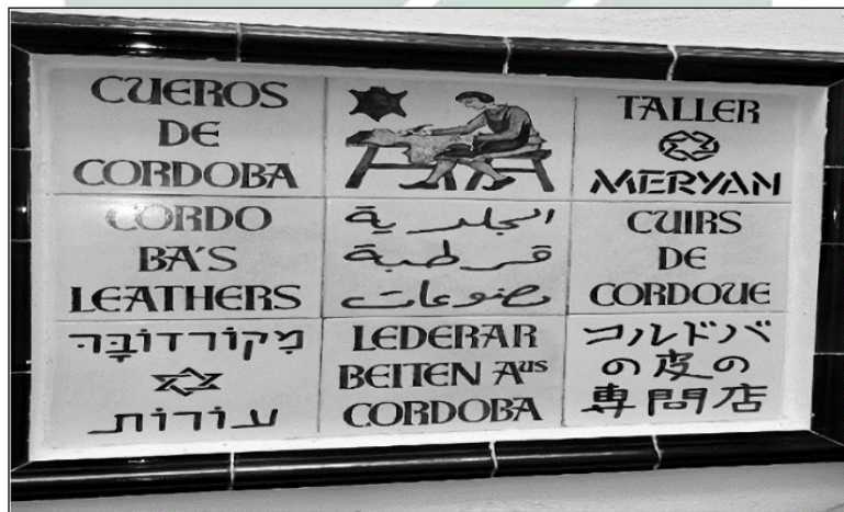
Figure 7. The Arabic Script at a Shop in Cordoba

The signs in figure 7 consist of several languages indicating the same meaning: Spanish ‘cueros de cordoba,’ English,