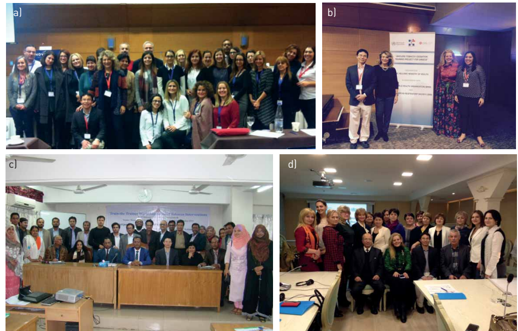
FIGURE 1 World Health Organization–European Respiratory Society Train the Trainer project first year experience in a, b) Greece (2016), c) Bangladesh (2017) and d) the Republic of Moldova (2016).