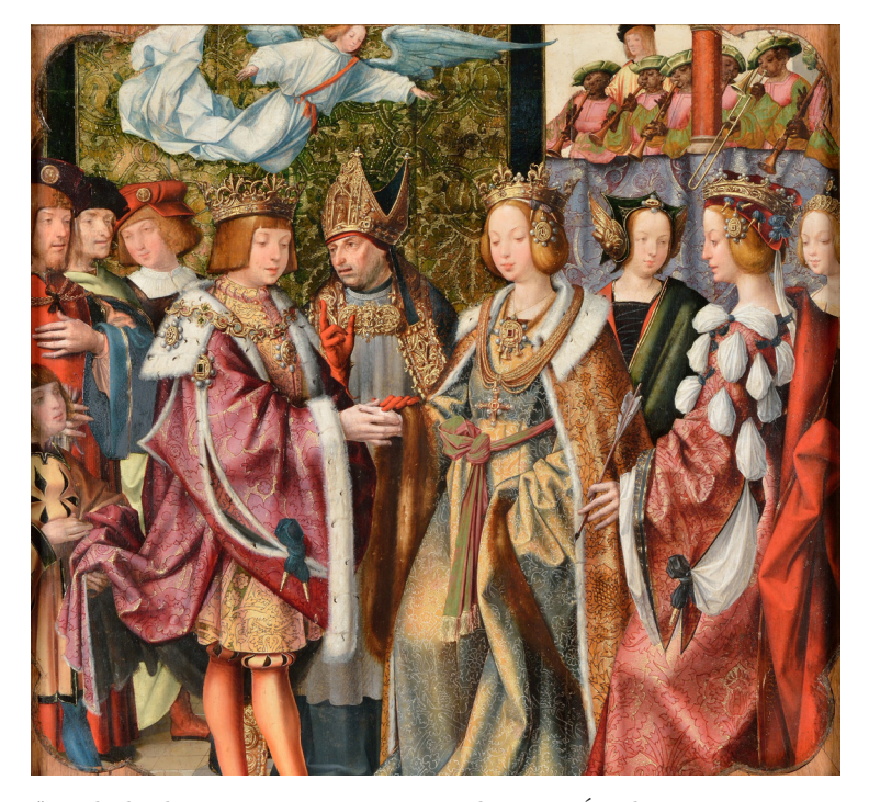
"Retábulo de Santa Auta: Casamento de Santa Úrsula com o Príncipe Conan" ("St Auta Altarpiece: Marriage of St Ursula and Prince Conan"), c.1522 / Unknown artist; phot. Sónia Costa. – Oil on oak. – MNAT – Museu Nacional de Arte Antiga, Lisbon. – In the upper right corner, a group of African musicians.

of Lisbon: "Slaves are everywhere. All work is performed by Ethiopian and Moor captives. Portugal is full of that kind of people". Although Clenard probably exaggerated when suggesting that "in Lisbon male and female slaves are believed to be more numerous than free Portuguese", his account clearly reveals the importance of slavery in sixteenth century Portugal (20).<sup>19</sup>