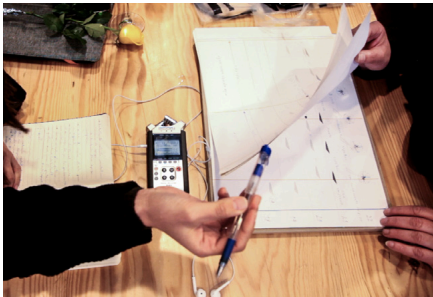
Figure 1. Rovisco and Barbosa discussing the score created for Identificación (1975)

of being documented? It is important to acknowledge that ‘documents’ are considered by many museum professionals as material traces that aim to represent performance-based works and thus to represent the un-representable . This tendency can be seen in many museums that list performance artworks in their collections and yet acquire and exhibit their material traces or related documentation (Calonje 2015). In these cases, transient works get lost either in the myriad of documents that remain, or in the absolute void of documents that do not exist. But how can these blurred lines become more recognisable? How does the decision-making process in conservation, and the micro-decisions made by the conservator, affect documentation practices? Or even, how can performance practices affect documentation practices in conservation?