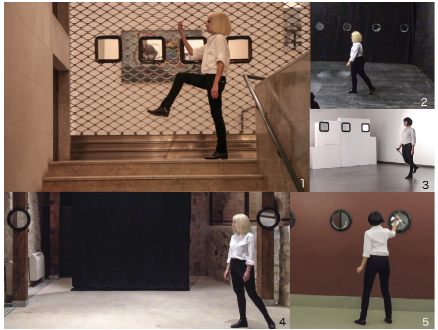
Figure 2. Composition showing pictures of the five different re-performances of Identificación : 1) Lisbon, Portugal; 2) Guimarães, Portugal; 3) Torres Vedras, Portugal; 4) Blanca, Spain; 5) Porto, Portugal

of Identificación 's re-actualisation, in this case, took the form not of a technical document, like those produced by conservators, but of an artistic documentary. In the same way, the micro-decisions that drove Rovisco's documentation process (which occurred concomitantly with her artistic process) influenced and were influenced by her performative practice and by her intention to transmit the bodily practice of the work . But how is Rovisco's documentation different from the documentation produced in the context of the work's conservation?