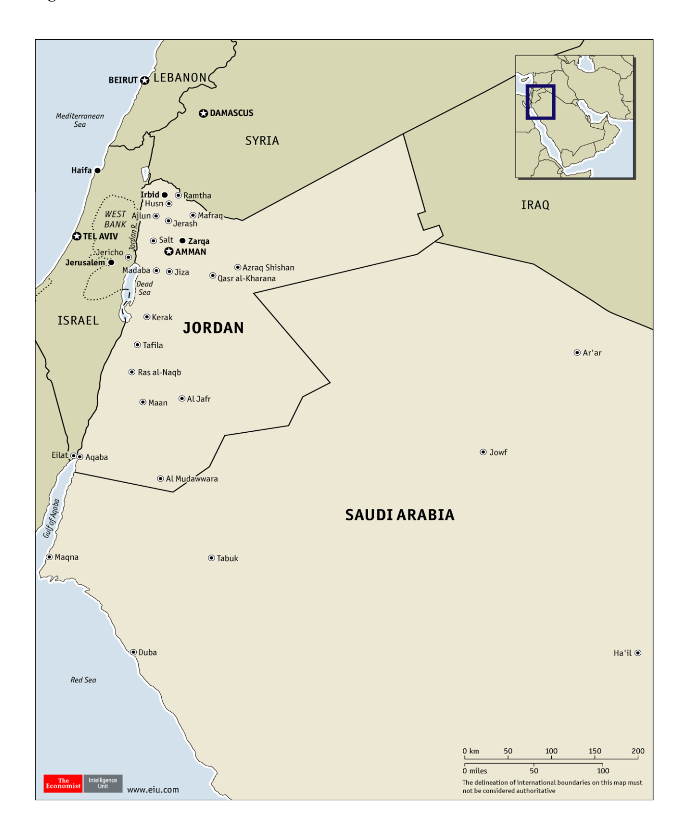
Figure 1. Northern Arabia