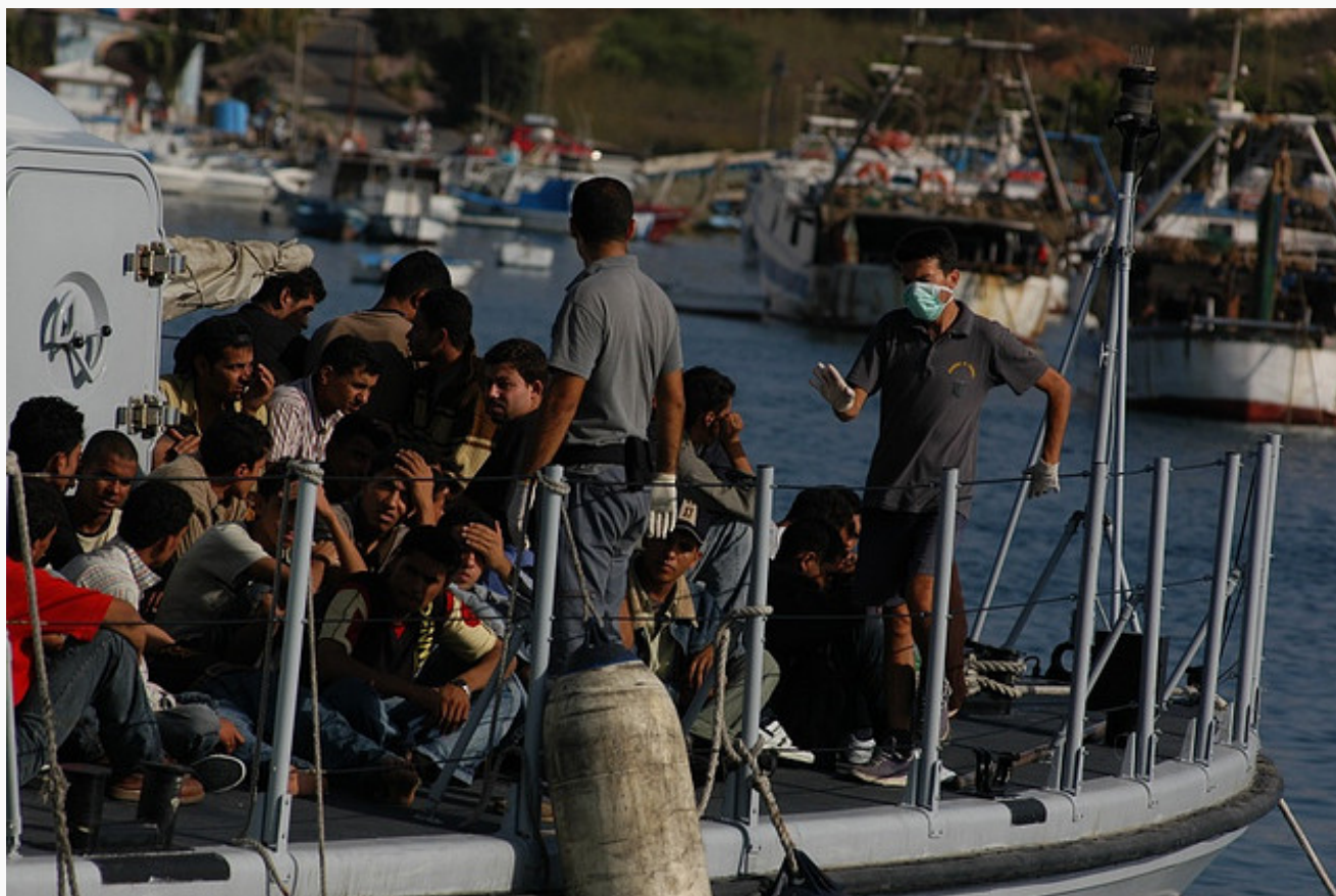
Migrants arriving on the island of Lampedusa in August 2007.