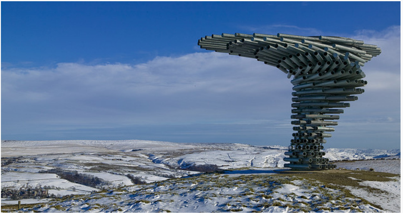
The Singing Ring Tree, part of the Panopticons project , in Burnley, Lancashire.

attention to the way archaeological insights provided inspiration for later post-structuralist commentaries on what architecture 'does' and how the 'body' is affected by 'space'.